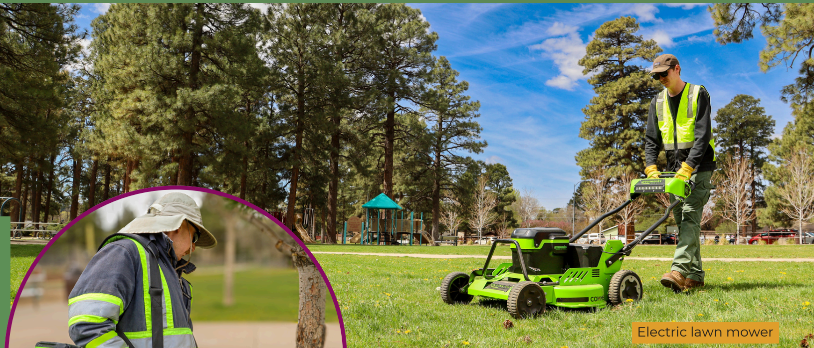
Electric lawn mower

Connecting our community through people, parks, natural areas, and programs.