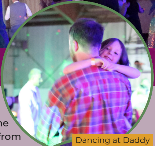
Dancing at Daddy Daughter Ball

Thank you to everyone who helped make this event so special!