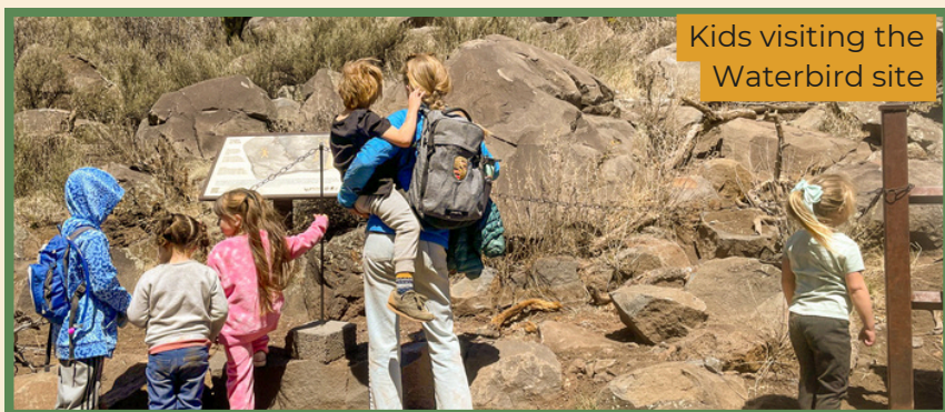
Kids visiting the Waterbird site

The Greater Observatory Mesa Area Trail Plan will be presented to Flagstaff City Council on Tuesday, May 13 th . The public is welcome to attend in person or online.