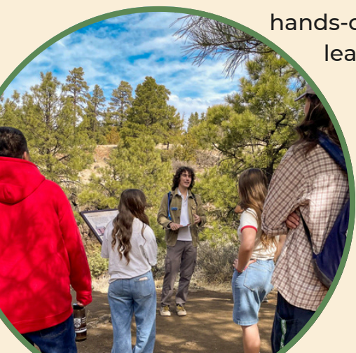
Field trip at Picture Canyon