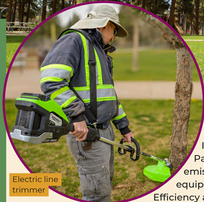
Electric line trimmer