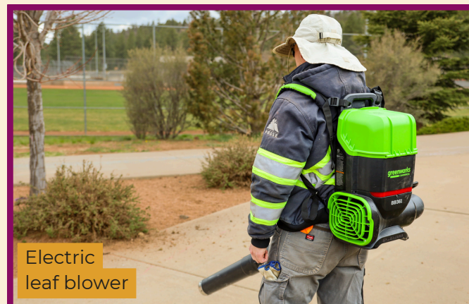
Electric leaf blower

In April, Parks received a suite of new electric tools. These included lawn mowers, leaf blowers, pressure washers, line trimmers, battery packs, and chargers. These energy-efficient tools have just recently deployed in the field, helping to reduce noise, improve air quality, and lower the City's overall carbon footprint. Parks is proud to contribute to Flagstaff's sustainability goals by integrating cleaner, quieter equipment into daily operations.