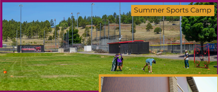
Summer Sports Camp

Hal Jensen Recreation Center has been busy with summer activities. Highlights include a Juneteenth Blood Drive, a Youth Resource & Sports Symposium in partnership with the Lived Black Experience, and exciting youth field trips—including a visit to an Arizona Wranglers game. The center also hosted a successful week of Summer Sports Camp, keeping kids active, engaged, and learning through play.