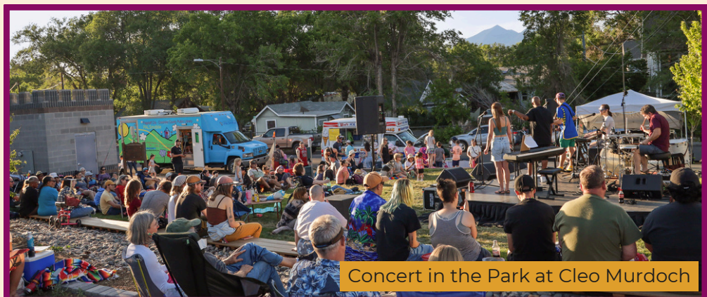
Concert in the Park at Cleo Murdoch