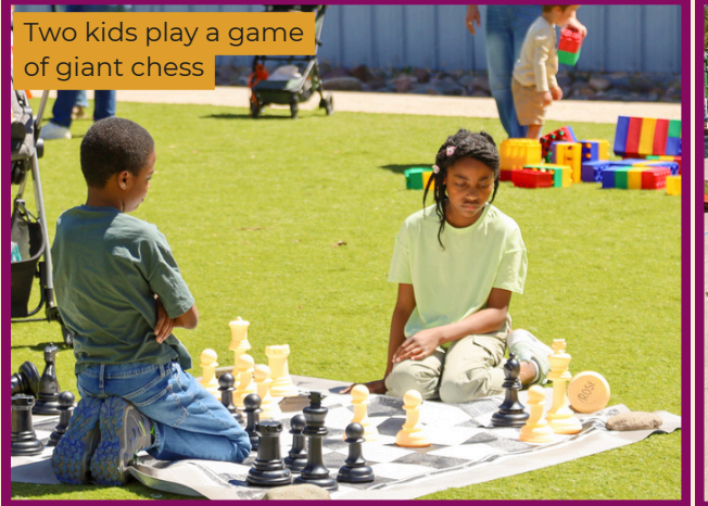
Two kids play a game of giant chess