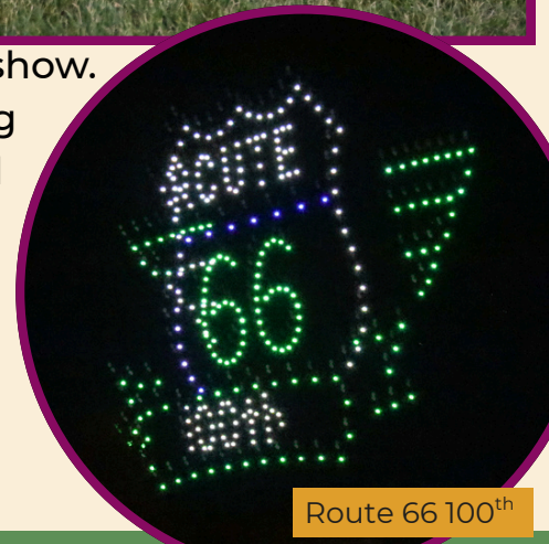
Route 66 100 th

PROSE launched Parks and Recreation Month in spectacular fashion with Flagstaff's first-ever Fourth of July Drone Show! In partnership with Economic Vitality, the event brought a fresh and innovative celebration to the community. After a competitive selection process, Open Sky Productions LLC was chosen to deliver the show. Coconino High School served as the ideal launch site, providing great views for the Sunnyside neighborhood, Buffalo Park, and McMillan Mesa. The show featured stunning drone displays choreographed to a custom soundtrack, showcasing Flagstaff's rich history, Native American heritage, and patriotic themes. Residents and visitors alike gathered to witness the one-of-a-kind experience, marking what we hope is the beginning of a new annual tradition.