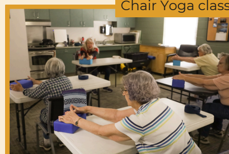
Chair Yoga class

The Joe C. Montoya Community & Senior Center Open House welcomed around 100 guests throughout the day. Visitors toured the facility, met staff, and participated in a selection of popular classes. Attendees had the opportunity to sample programs such as Stand Tall Don't Fall, Chair Yoga, Senior Stretch & Mobility, Wisdom Seekers, and Tai Chi—offering a well-rounded glimpse into the wellness and enrichment opportunities available at the center year-round.