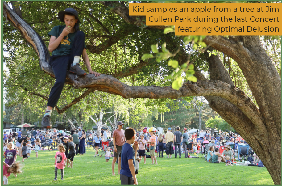
Kid samples an apple from a tree at Jim Cullen Park during the last Concert featuring Optimal Delusion