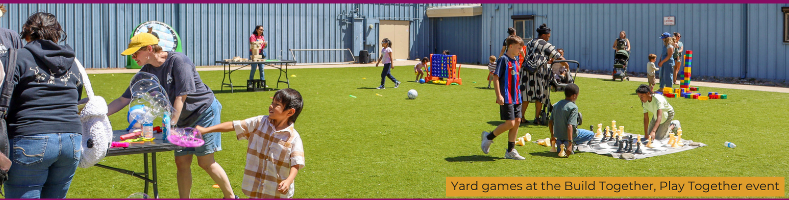
Yard games at the Build Together, Play Together event