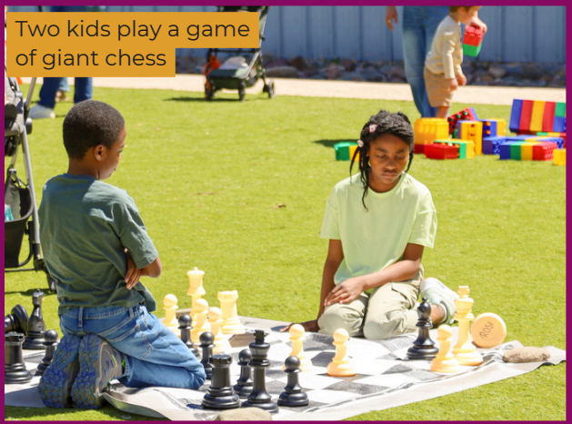
Two kids play a game of giant chess