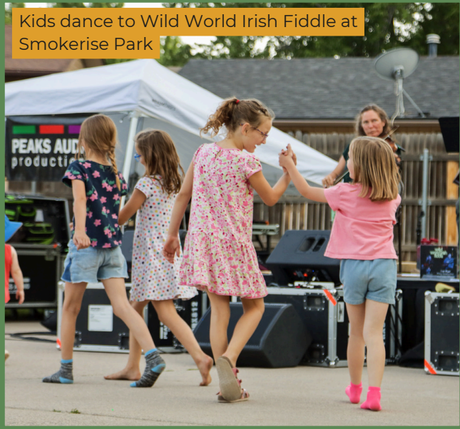
Kids dance to Wild World Irish Fiddle at Smokerise Park