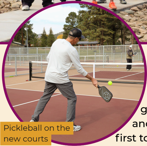
Pickleball on the new courts