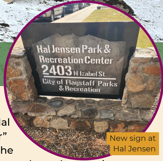
New sign at Hal Jensen