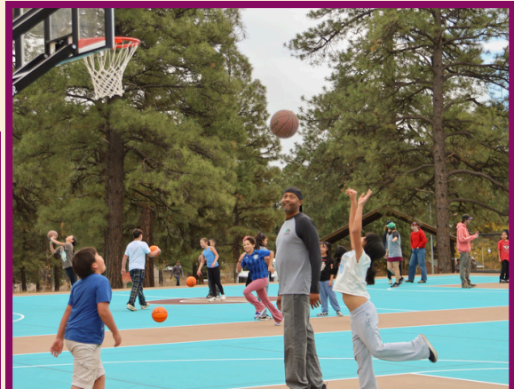
Students from Thomas playing various sports on the new courts