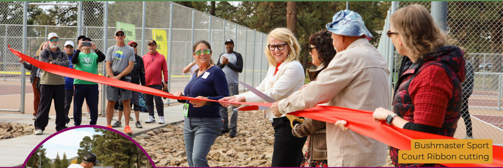
Bushmaster Sport Court Ribbon cutting

Connecting our community through people, parks, natural areas, and programs.