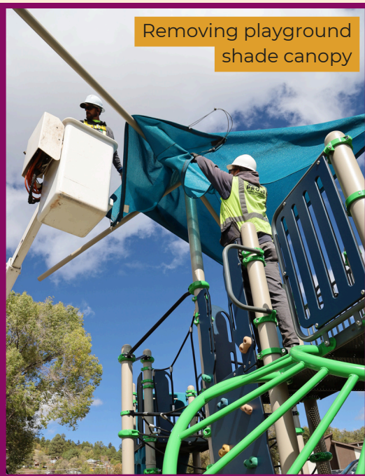
Removing playground shade canopy

Parks staff have been busy preparing for the winter season by taking steps to protect park infrastructure from cold temperatures and snow. This process includes, removing shade canopies, wind screens, and shutting down irrigation systems and drinking fountains to prevent freezing. These steps help keep our parks safe and protected during the colder months.