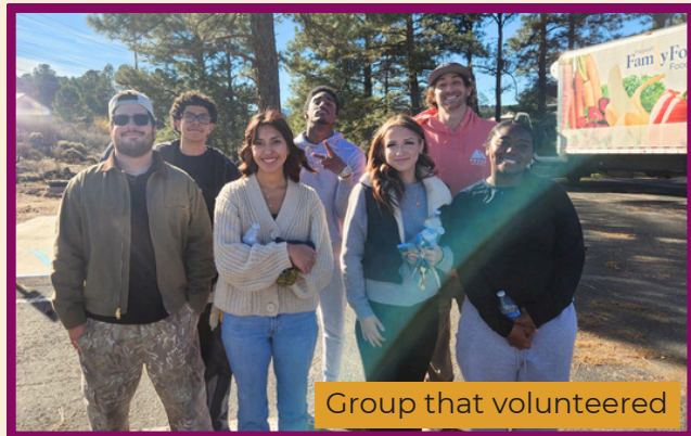
Group that volunteered

On November 24th, staff from Hal Jensen Recreation Center, along with several youth volunteers, gave their time to support the Flagstaff Family Food Center. From 11:30 AM to 2:00 PM, they