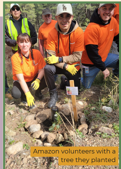
Amazon volunteers with a tree they planted