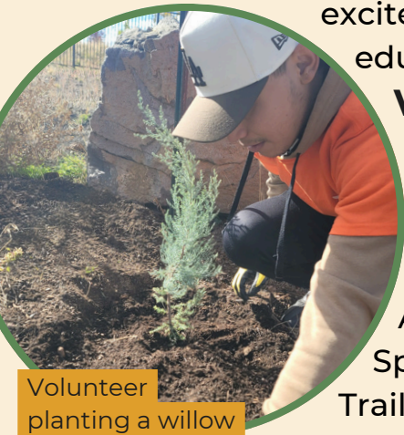
Volunteer planting a willow

Open Space hosted several volunteer groups this month including staff from Amazon and Arc'teryx. Amazon volunteers helped plant trees and replace damaged watering stakes at McMillan Mesa Natural Area. Arc'teryx employees from Canada and beyond joined Open Space staff to improve stormwater drainage on the Tom Moody Trail at Picture Canyon.