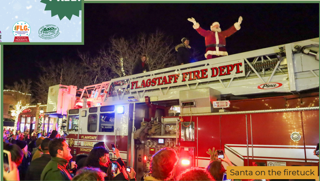
Santa on the firetruck