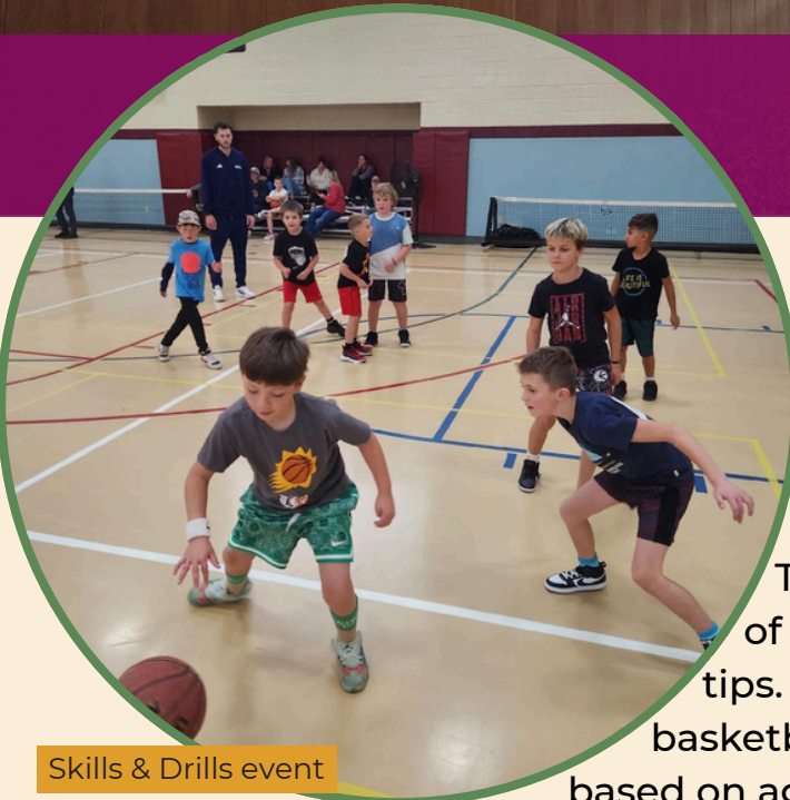
Skills & Drills event