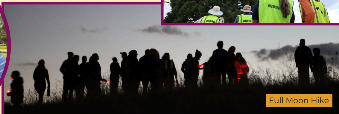
Full Moon Hike