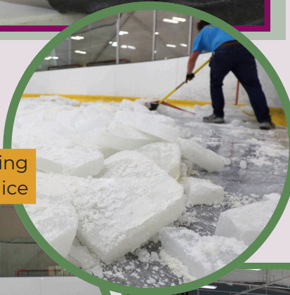
Removing the ice

Jay Lively Activity Center managed to complete many large projects during the annual cleaning and maintenance closure, including the removal of the entire sheet of ice in order to fix cracks in the surface. This project was a tremendous undertaking and could not have been done without the hard work of all the staff at Jay Lively who went above and beyond their normal duties. Sincere gratitude goes out to staff from JLAC as well as City Facilities for assisting with the complex projects. The fresh ice and clean facility have been appreciated by all.