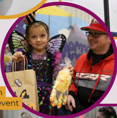
Halloween Carnival event