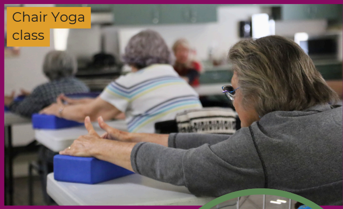
Chair Yoga class