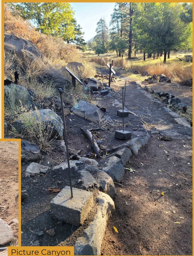
Picture Canyon restoration work

Over the course of the year, four miles of restoration work was completed at Picture Canyon with the help of the Arizona Conservation Corps and one hundred and eighty-five people who volunteered a total of 589 hours of work. The Arizona Conservation Corps also completed installing stone steps at the Petroglyph Overlook and re-routed the trail at the Waterbird Petroglyph Site so that it is no longer right up against the boulders with petroglyphs, which invited scratched graffiti.