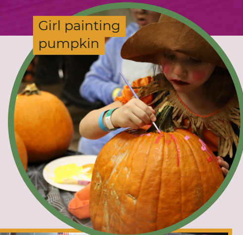
Girl painting pumpkin

October was packed with Halloween events for the whole family. The Aquaplex introduced a new event called the Pumpkin Plunge where participants could swim in a pool full of floating pumpkins and take one home. Hal Jensen Recreation Center hosted a Halloween Carnival with over one hundred visitors through the door, and Jay Lively Activity Center hosted their annual Spooky Skate event that saw more attendees than any other year.