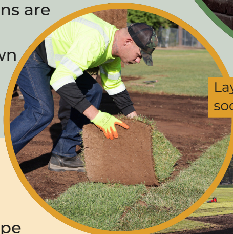
Laying the new sod

Parks is excited to have begun the process of replacing existing park kiosk signs with new metal signs designed by Parks staff themselves. These signs are a much-needed improvement from the previous signs, which break down over time due to sun exposure. This year, the Parks team upgraded seven signs throughout Flagstaff.