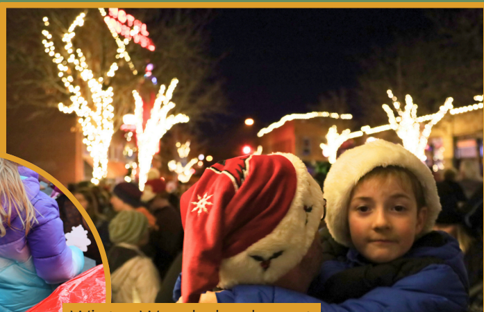
Winter Wonderland event

Another successful Winter Wonderland for the books! Thanks to the partnership with the Downtown Business Alliance and sponsors, around 6,500 people attended this event.