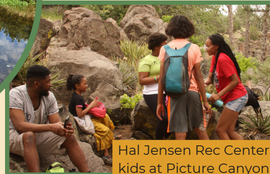
Hal Jensen Rec Center kids at Picture Canyon