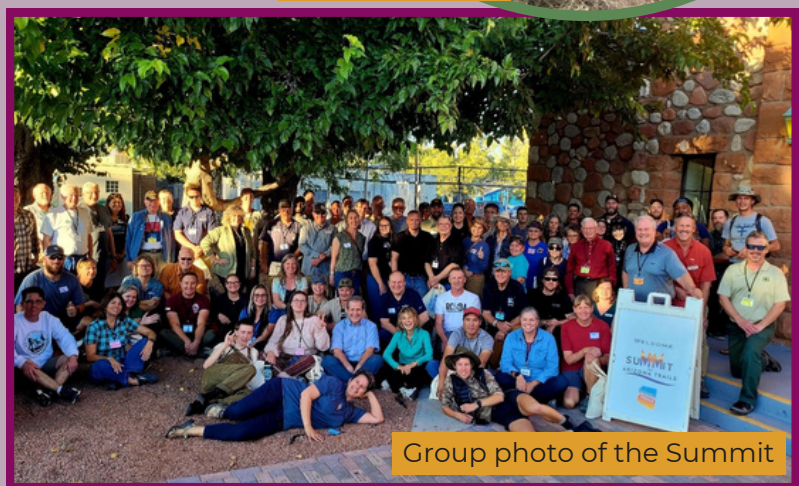
Group photo of the Summit

Open Space staff attended the Summit for Arizona Trails in Cottonwood, Arizona where they learned about trail planning and management.