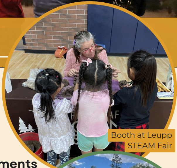
Booth at Leupp STEAM Fair

Open Space participated in the Leupp Elementary STEAM Fair where they hosted a booth to engage with students about the importance of Open Space and natural areas. They offered an activity for students to mix water, soil, clay, and native seeds to make a seed ball that could be tossed in their yard to spread native grasses.