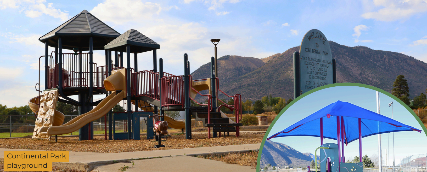
Continental Park playground