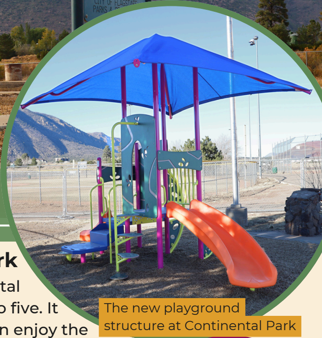
The new playground structure at Continental Park