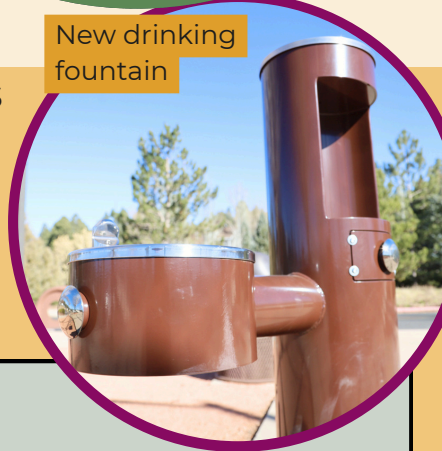
New drinking fountain

A total of ten new drinking fountains with water bottle fill stations have been installed throughout our athletic and park spaces. Parks staff have been hard at work to replace the old and outdated fountains. The fountains are currently turned off for the winter but will be up and running in the spring.