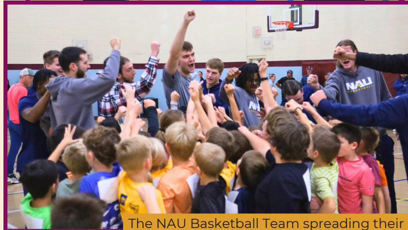
The NAU Basketball Team spreading their enthusiasm for the sport