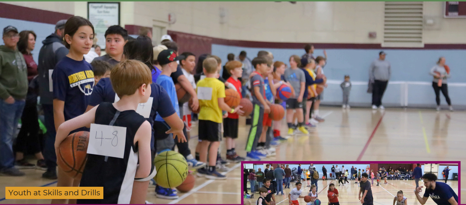
Youth at Skills and Drills

Connecting our community through people, parks, natural areas, and programs.