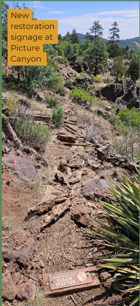
New restoration signage at Picture Canyon