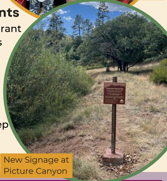
New Signage at Picture Canyon