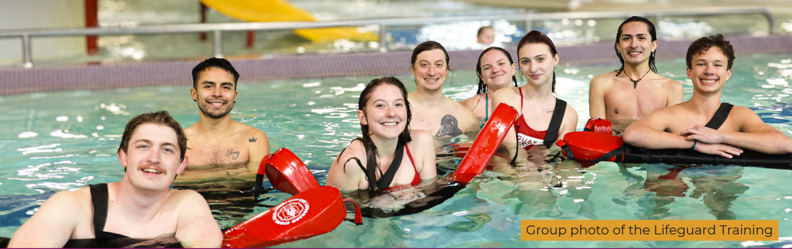
Group photo of the Lifeguard Training