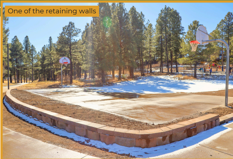
One of the retaining walls

Parks staff constructed two new brick retaining walls around the basketball courts at Foxglenn Park. These walls add structural support to the landscape as they direct water flow around the courts and mitigate erosion on the slopes. The walls also create a new space for landscaping in the future, including pollinator areas, adding to the aesthetics of the community.