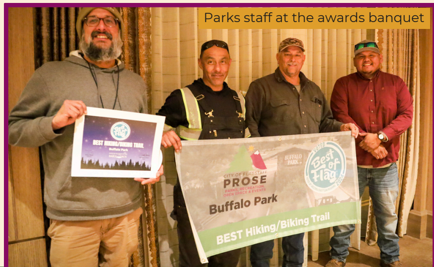
Parks staff at the awards banquet

This is the second year in a row that Buffalo Park has received this award but the first time Parks staff have been able to attend the awards ceremony. PROSE is extremely pleased that the community chose Buffalo Park for this award. As Parks continue to maintain and improve this park, it’s always nice to know that the local community appreciates all it has to offer.