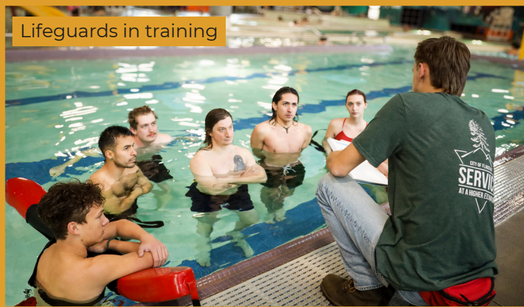
Lifeguards in training