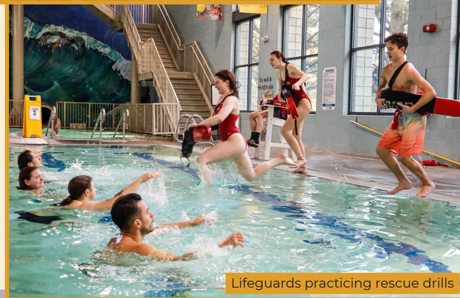
Lifeguards practicing rescue drills