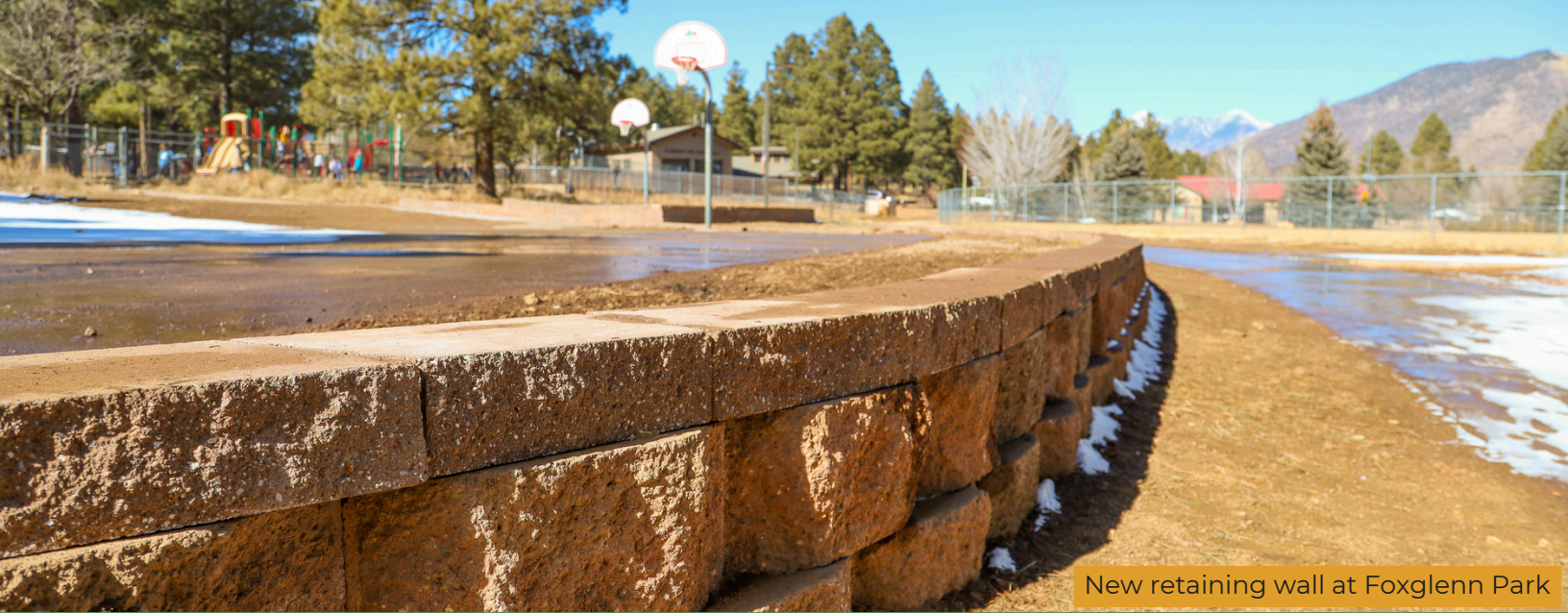
New retaining wall at Foxglenn Park