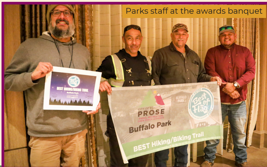
Parks staff at the awards banquet

This is the second year in a row that Buffalo Park has received this award but the first time Parks staff have been able to attend the awards ceremony. PROSE is extremely pleased that the community chose Buffalo Park for this award. As Parks continue to maintain and improve this park, it’s always nice to know that the local community appreciates all it has to offer.