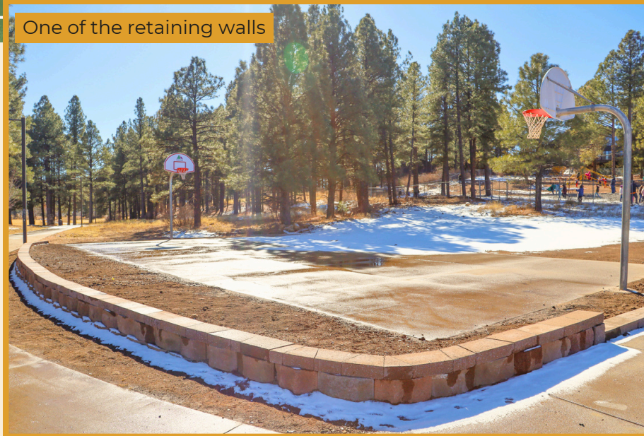
One of the retaining walls

Parks staff constructed two new brick retaining walls around the basketball courts at Foxglenn Park. These walls add structural support to the landscape as they direct water flow around the courts and mitigate erosion on the slopes. The walls also create a new space for landscaping in the future, including pollinator areas, adding to the aesthetics of the community.