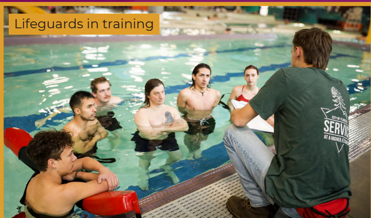
Lifeguards in training