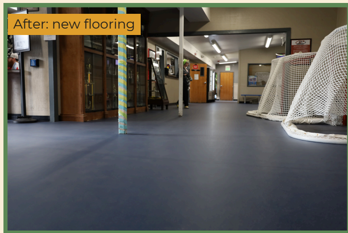
After: new flooring

At Jay Lively, the floor was replaced throughout the entire facility, including the lobby, party room, pro shop, bathrooms, Zamboni room, back hallways, and locker rooms. Deep cleaning and dasher board maintenance also took place to improve the overall condition of the facility.