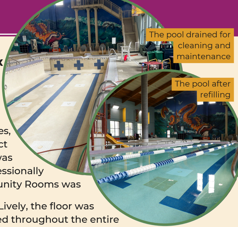
The pool drained for cleaning and maintenance

The annual maintenance closures at the Aquaplex and Jay Lively Activity Center provided the opportunity for extensive improvements and deep cleaning. At the Aquaplex, the pool was drained, cleaned, and refilled. The pool deck, gym floor, offices, and party room were thoroughly cleaned, with select areas receiving fresh coats of paint. The gym floor was refinished, and the main hallway carpets were professionally cleaned. Audio and visual equipment in the Community Rooms was also upgraded.