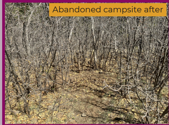
Abandoned campsite after