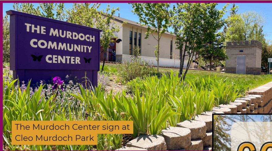
The Murdoch Center sign at Cleo Murdoch Park

The grand opening of Cleo Murdoch Park (203 E Brannen Ave) takes place on Wednesday, June 11 at 4:30 PM . All are welcome to celebrate this exciting new addition to the community and stay afterward to enjoy live music by Dub and Down with the Blues as part of Concerts in the Park.