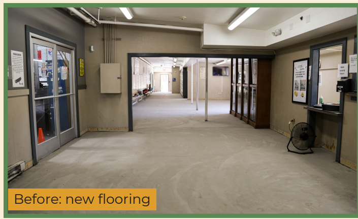
Before: new flooring