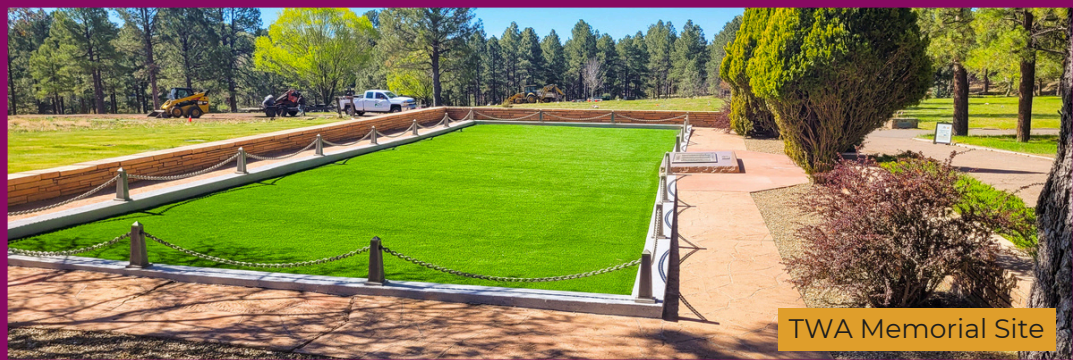
TWA Memorial Site

Parks recently completed the replacement of two aging playground structures at Mobile Haven and Smokerise Park. The new structures, designed for children ages two to five, feature accessible elements and are thoughtfully designed to compliment the larger playgrounds already in place at each location.