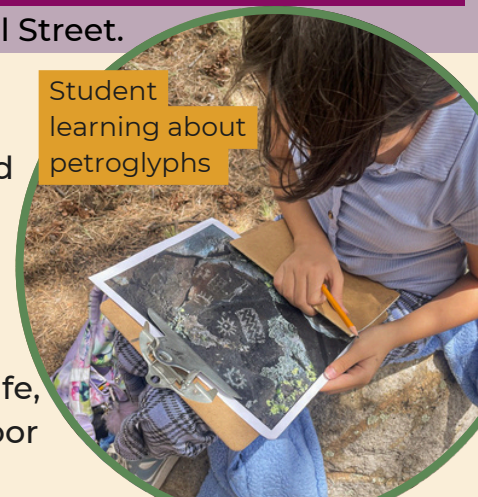
Student learning about petroglyphs

The Open Space Education team partnered with Willow Bend to deliver a three-day in-class program for Mount Elden Middle School 6th graders. Students explored Picture Canyon’s cultural history, wildlife, and plant life through nature journaling, investigative tools, and outdoor exploration near their school.