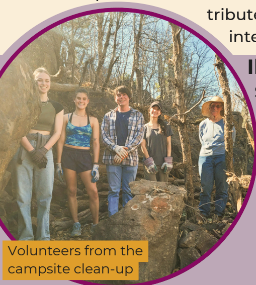
Volunteers from the campsite clean-up

Open Space is proud to announce the installation of a commemorative plaque honoring the community effort that led to the protection of the McMillan Mesa Natural Area. This area was preserved as Open Space thanks to the dedication of a committee of Flagstaff residents who successfully placed a measure on the November 2016 ballot—an initiative that passed with overwhelming support, receiving 86% of the vote. The City of Flagstaff recognizes the importance of commemorating this community effort and acknowledges the tremendous collective public effort that preserved the McMillan Mesa Natural Area. We invite the public to visit this meaningful tribute, located on the east side of the Cedar Avenue Bridge at the intersection of Cedar Trail and the Arizona Trail.