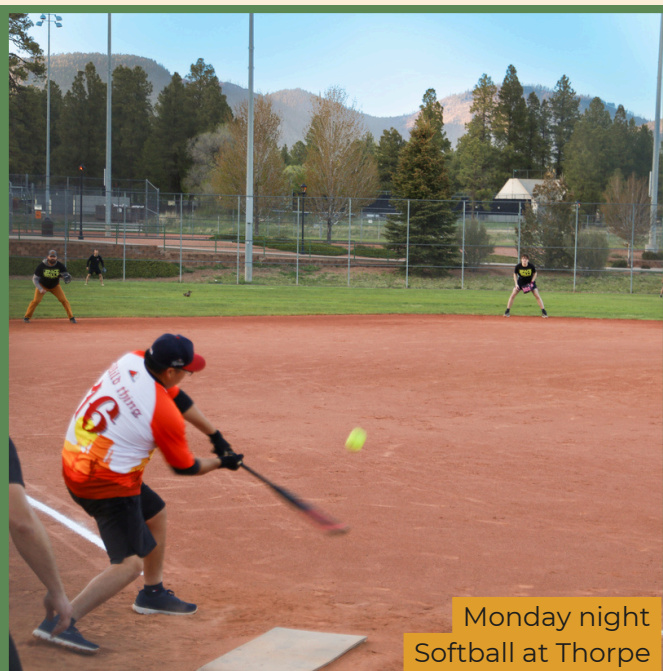
Monday night Softball at Thorpe

The Athletics team has been hard at work! May kicked off our tournament season with four athletic tournaments being hosted throughout the month including girls' softball, soccer, baseball and senior softball.