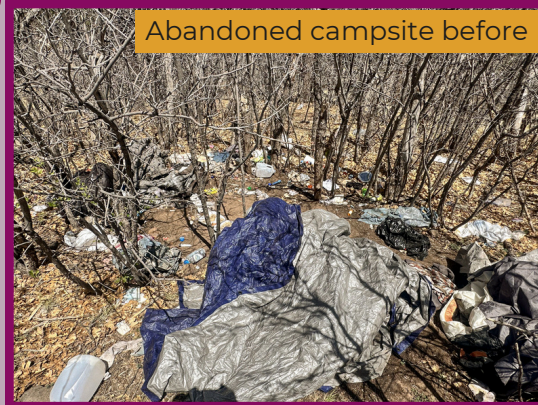
Abandoned campsite before

Several NAU student groups helped clean up abandoned campsites on the McMillan Mesa, following reports from an Open Space Steward and a local resident. Notices were posted in advance, and outreach was made to individuals at active sites.