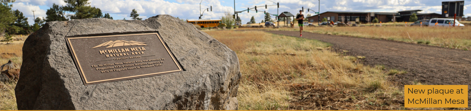
New plaque at McMillan Mesa