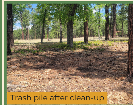
Trash pile after clean-up