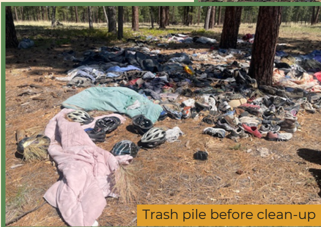
Trash pile before clean-up