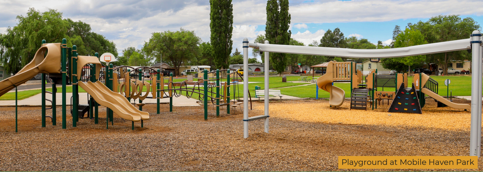
Playground at Mobile Haven Park