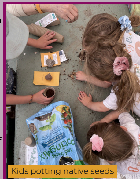
Kids potting native seeds

In June, Open Space staff participated in two engaging educational events to connect local youth with Flagstaff's natural environment. At Willow Bend's Science Saturday, around 30 participants explored the theme of Junior Naturalist. Open Space staff hosted a hands-on booth highlighting native plants found across Flagstaff's Open Space properties. Kids created leaf