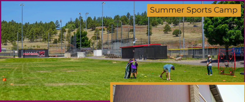
Summer Sports Camp