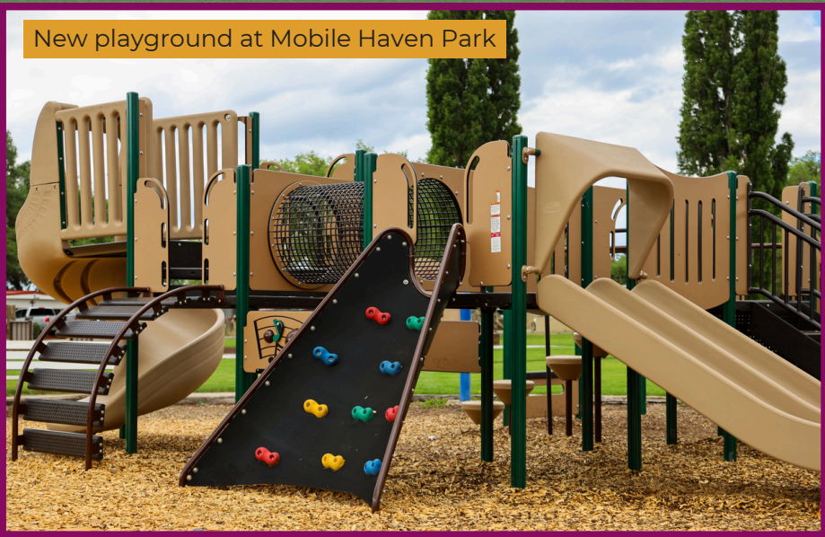
New playground at Mobile Haven Park

Exciting news for our youngest community members! A brand-new playground designed specifically for children ages 2–5 has been installed at Mobile Haven Park. This new addition beautifully complements the existing playground for ages 5–12, creating a cohesive and inclusive play space for families. The new play structure features a tunnel, two different slides, a climbing wall, musical elements, and more—offering a fun and engaging experience that supports both physical activity and creative play.