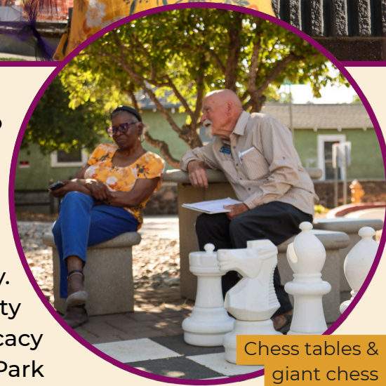
Chess tables & giant chess

The park was made possible through funding from the Community Development Block Grant program. Following the ribbon-cutting, attendees enjoyed a Concert in the Park with Dub and Down with the Blues, filling the new space with music and celebration.