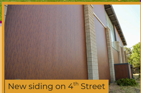
New siding on 4 th Street

The Aquaplex siding project is progressing smoothly, with over 75% of the total work now complete. Trim and seal work on the east side of the building has been fully finished, and siding installation along 4th Street is currently underway. The upgraded exterior is taking shape and will enhance both the appearance and durability of the facility.