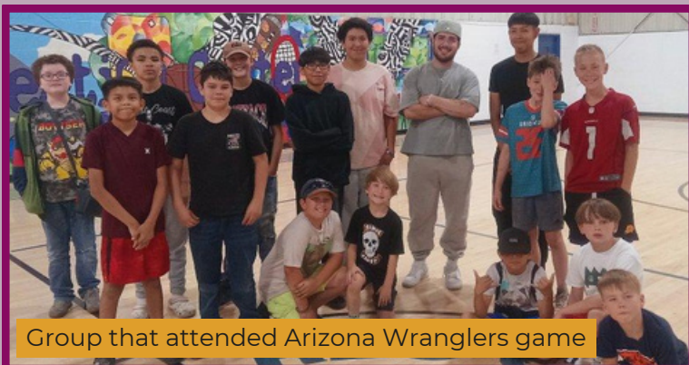
Group that attended Arizona Wranglers game

Black Experience, and exciting youth field trips—including a visit to an Arizona Wranglers game. The center also hosted a successful week of Summer Sports Camp, keeping kids active, engaged, and learning through play.