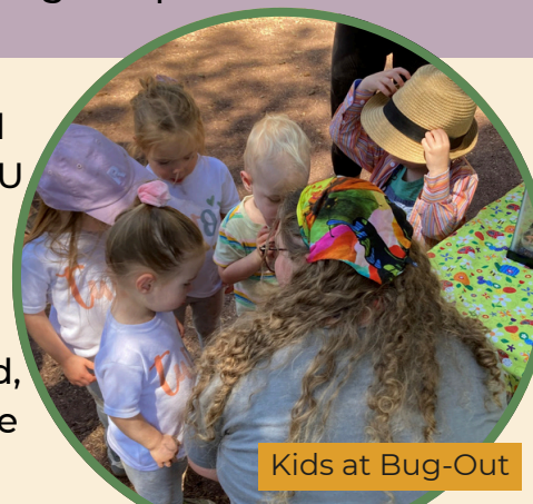
Kids at Bug-Out

This year's Bug Out event was a success, drawing 124 participants and featuring hands-on activities from four partner organizations. The NAU Bug Lab brought live insects and an educational display board, while the City's Sustainability Team offered a pollinator wheel game and native seed giveaways. Arizona Game & Fish gave kids the chance to explore aquatic macroinvertebrates found right in Frances Short Pond, and Open Space hosted a booth where participants learned about bee baths and created their own wildflower cups to take home.