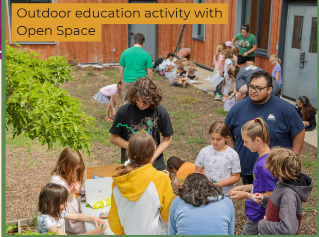
Outdoor education activity with Open Space