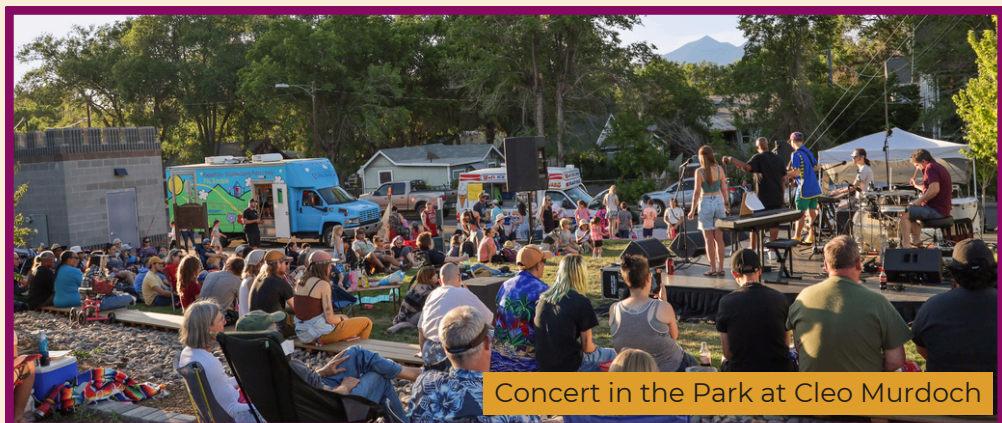
Concert in the Park at Cleo Murdoch