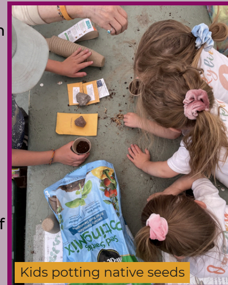
Kids potting native seeds

In June, Open Space staff participated in two engaging educational events to connect local youth with Flagstaff's natural environment. At Willow Bend's Science Saturday, around 30 participants explored the theme of Junior Naturalist. Open Space staff hosted a hands-on booth highlighting native plants found across Flagstaff's Open Space properties. Kids created leaf