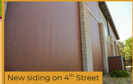
New siding on 4 th Street

The Aquaplex siding project is progressing smoothly, with over 75% of the total work now complete. Trim and seal work on the east side of the building has been fully finished, and siding installation along 4th Street is currently underway. The upgraded exterior is taking shape and will enhance both the appearance and durability of the facility.