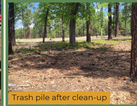
Trash pile after clean-up