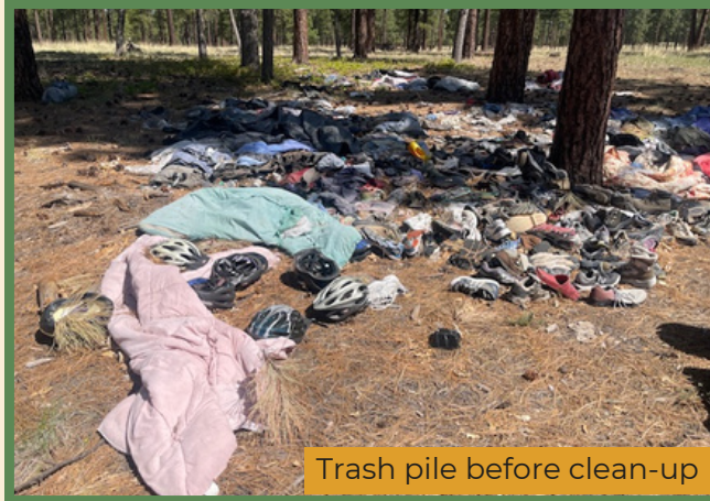
Trash pile before clean-up