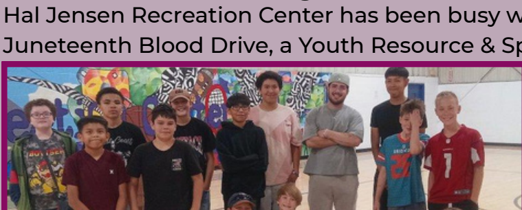
Group that attended Arizona Wranglers game

Hal Jensen Recreation Center has been busy with summer activities. Highlights include a Juneteenth Blood Drive, a Youth Resource & Sports Symposium in partnership with the Lived Black Experience, and exciting youth field trips—including a visit to an Arizona Wranglers game. The center also hosted a successful week of Summer Sports Camp, keeping kids active, engaged, and learning through play.