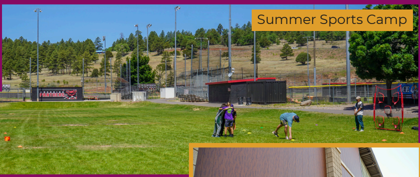
Summer Sports Camp

Hal Jensen Recreation Center has been busy with summer activities. Highlights include a Juneteenth Blood Drive, a Youth Resource & Sports Symposium in partnership with the Lived Black Experience, and exciting youth field trips—including a visit to an Arizona Wranglers game. The center also hosted a successful week of Summer Sports Camp, keeping kids active, engaged, and learning through play.