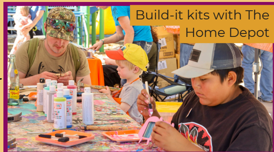
Build-it kits with The Home Depot

PROSE celebrated the end of Parks & Recreation Month with a brand-new Build Together, Play Together event. This was a collaborative effort from Recreation Coordinators across all four recreation centers, along with support from Events, Marketing, and Athletics. Thanks to The Home Depot, kids and families had the opportunity to build projects together with hands-on kits. The event also featured bubbles, yard games, crafts, a mini-golf course, and more! Community partners including the Flagstaff Police Department, Flagstaff Fire Department, Scoop There It Is Ice Cream, and Soul Coffee added to the festive atmosphere. Over the course of the day, approximately 250 attendees joined the fun, making this event a big success.