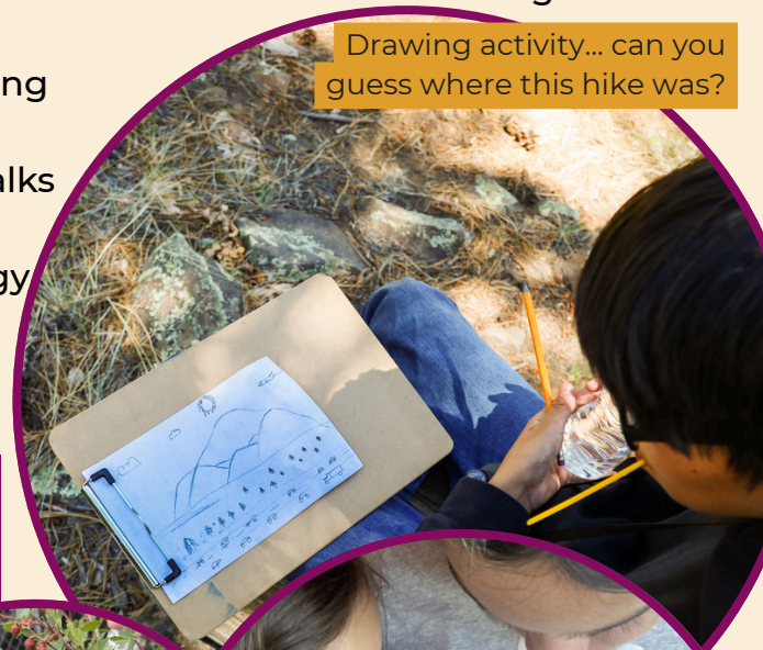
Drawing activity... can you guess where this hike was?

By integrating nature-based education into recreation programs, PROSE continues to foster curiosity, wellness, and environmental stewardship across all ages.