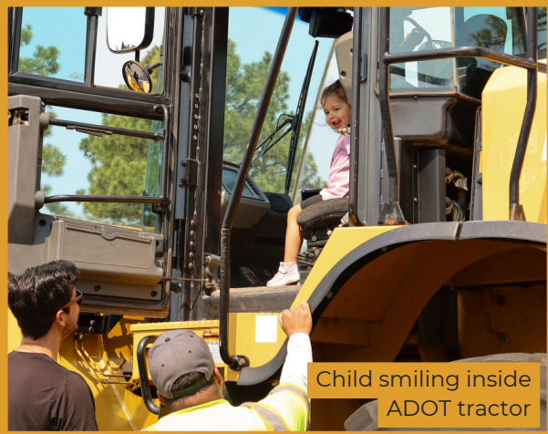
Child smiling inside ADOT tractor