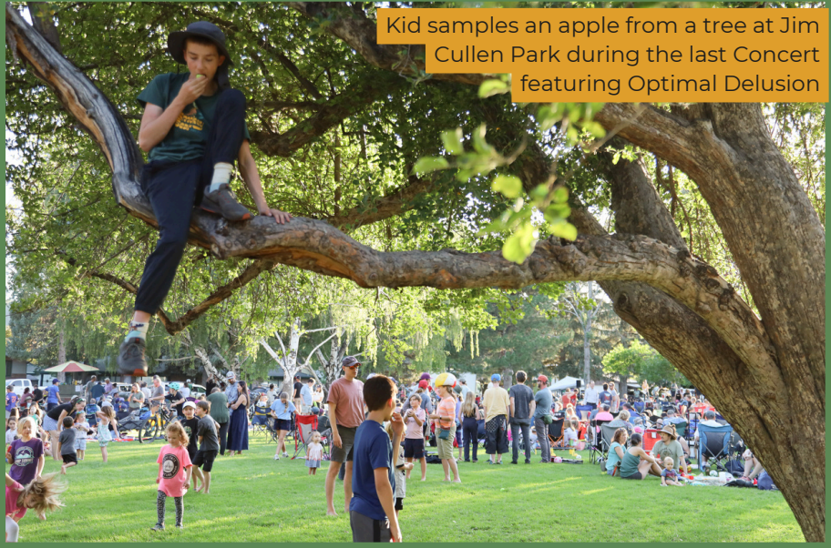
Kid samples an apple from a tree at Jim Cullen Park during the last Concert featuring Optimal Delusion