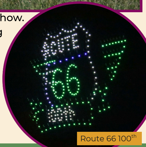
Route 66 100 th

PROSE launched Parks and Recreation Month in spectacular fashion with Flagstaff's first-ever Fourth of July Drone Show! In partnership with Economic Vitality, the event brought a fresh and innovative celebration to the community. After a competitive selection process, Open Sky Productions LLC was chosen to deliver the show. Coconino High School served as the ideal launch site, providing great views for the Sunnyside neighborhood, Buffalo Park, and McMillan Mesa. The show featured stunning drone displays choreographed to a custom soundtrack, showcasing Flagstaff's rich history, Native American heritage, and patriotic themes. Residents and visitors alike gathered to witness the one-of-a-kind experience, marking what we hope is the beginning of a new annual tradition.