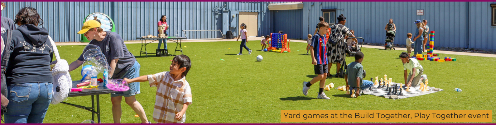
Yard games at the Build Together, Play Together event