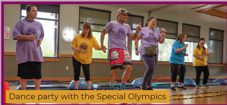
Dance party with the Special Olympics