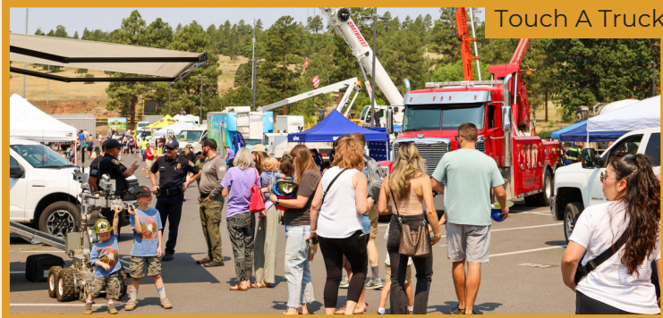
Touch A Truck