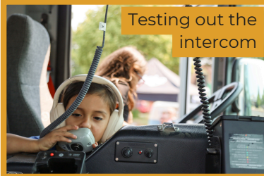
Testing out the intercom