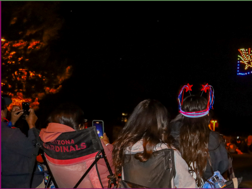
Spectators enjoying the Drone Show at Coconino High School

Connecting our community through people, parks, natural areas, and programs.