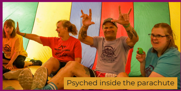
Psyched inside the parachute