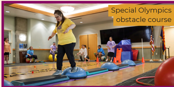
Special Olympics obstacle course