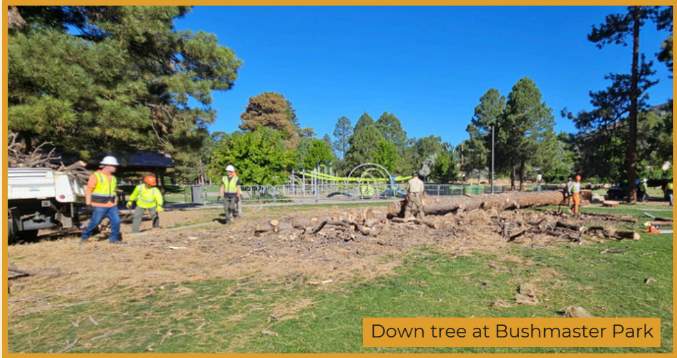
Down tree at Bushmaster Park

This month, Parks partnered with the City’s Wildland Fire Crew to successfully remove a large dead ponderosa pine tree located near the playground at Bushmaster Park. The hazardous tree posed a safety concern for park visitors. Rather than contracting the work externally, this collaborative effort served a dual purpose: eliminating a public safety hazard while also providing a valuable training opportunity for both the Parks team and Wildland Fire personnel. This is a great example of interdepartmental teamwork benefiting both the community and city staff.