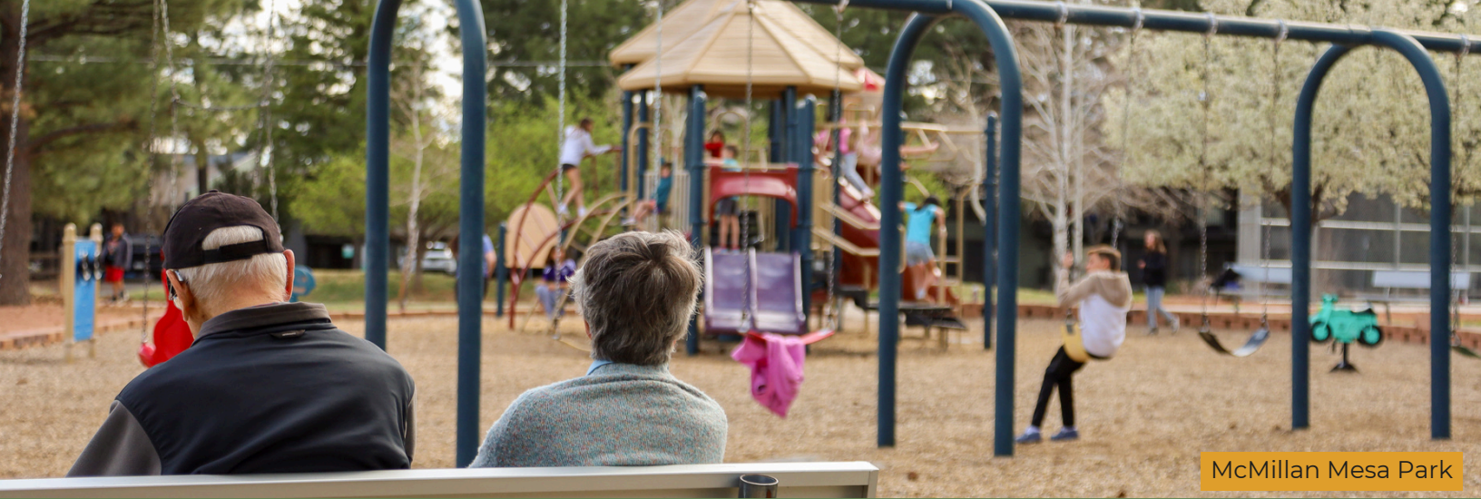
McMillan Mesa Park