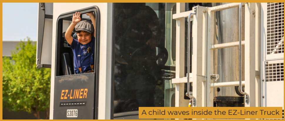
A child waves inside the EZ-Liner Truck