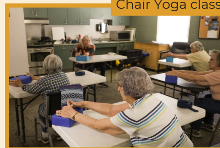
Chair Yoga class

The Joe C. Montoya Community & Senior Center Open House welcomed around 100 guests throughout the day. Visitors toured the facility, met staff, and participated in a selection of popular classes. Attendees had the opportunity to sample programs such as Stand Tall Don't Fall, Chair Yoga, Senior Stretch & Mobility, Wisdom Seekers, and Tai Chi—offering a well-rounded glimpse into the wellness and enrichment opportunities available at the center year-round.