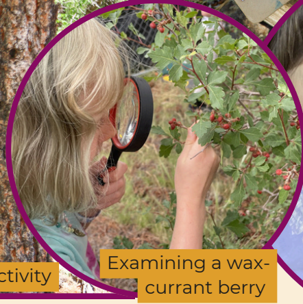
Examining a wax-currant berry