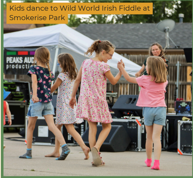
Kids dance to Wild World Irish Fiddle at Smokerise Park