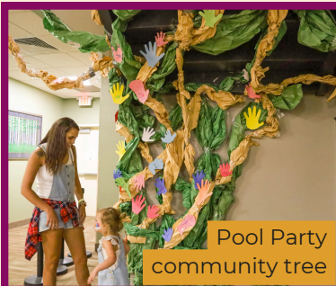
Pool Party community tree