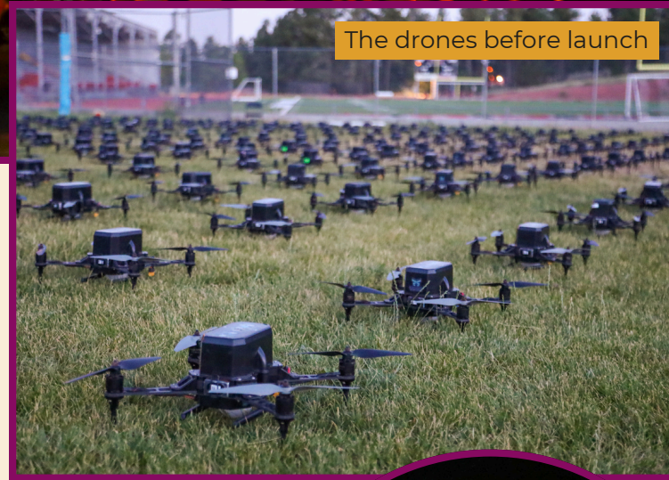
The drones before launch