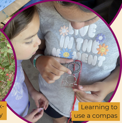
Learning to use a compass