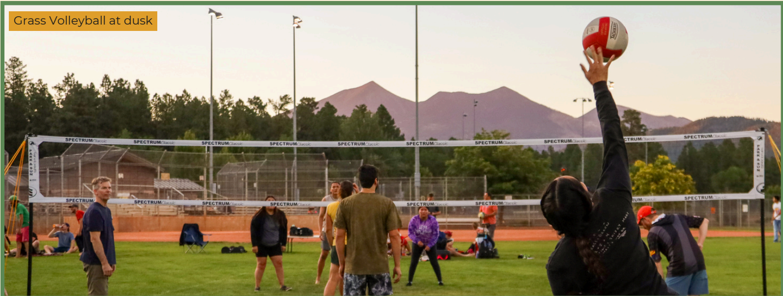
Grass Volleyball at dusk