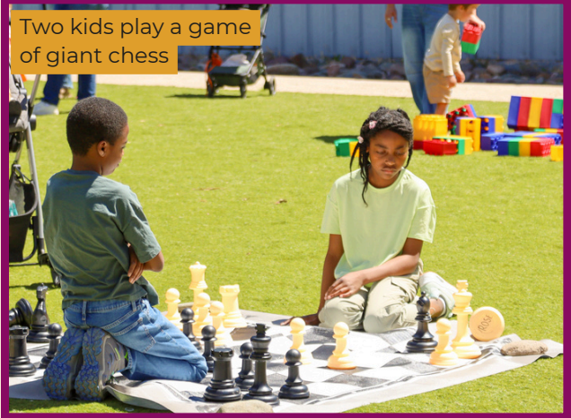
Two kids play a game of giant chess