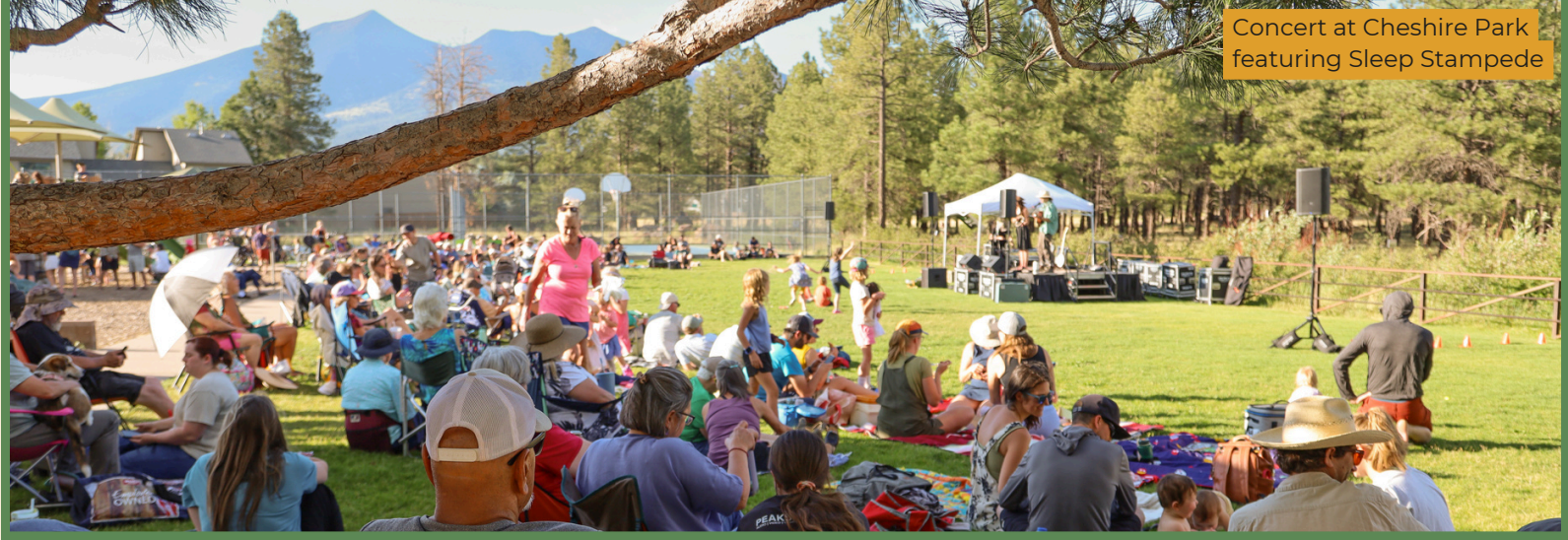
Concert at Cheshire Park featuring Sleep Stampede