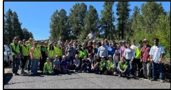
Photo: Volunteers at the Watershed Cleanup event.