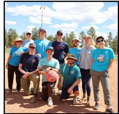
Photo: Albert Aces compete at the Employee Kickball Tournament.