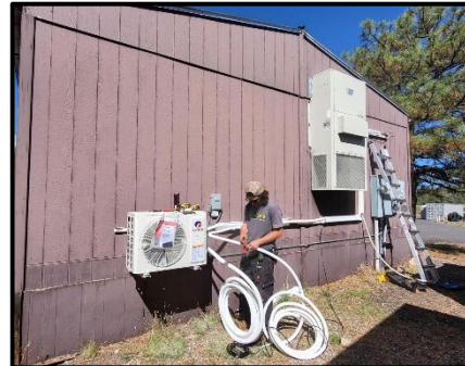
Photos: New cold-climate heat pumps installed at Fire Station 1 (left) and the Fire Training Center (right) and inspected by Facilities staff.