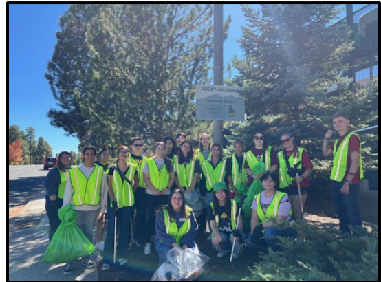
Photo: NAU Disney Club Cleanup Group Photo