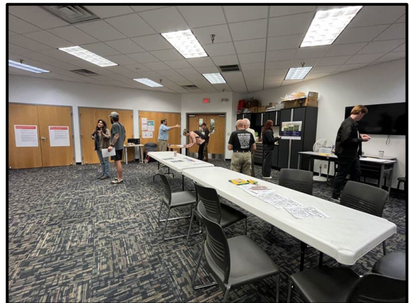
Photo: Community members giving feedback at the October 8 th Food Action Plan Open House