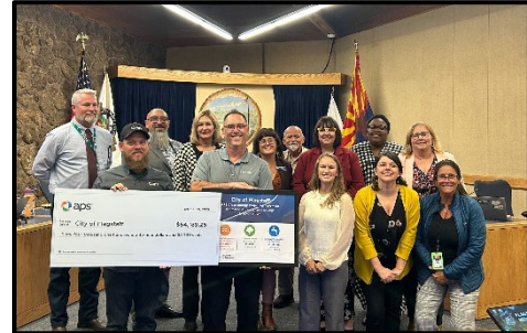
Photo: City Council and staff receive certificate and check from APS for completing energy-saving upgrades.

City Council approved an Intergovernmental Agreement to explore clean energy opportunities to advance carbon neutrality goals with a coalition of cities and universities across the state on October 7 th .