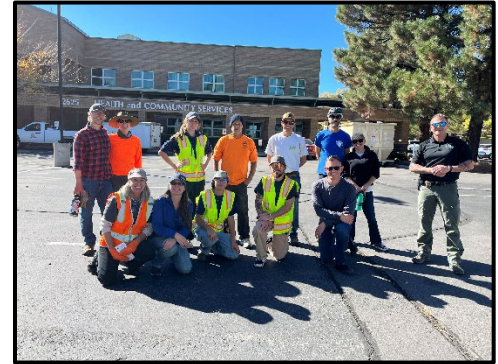
Photo: Volunteer Group photo after the Drop-off Day Event.