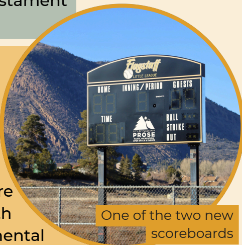
One of the two new scoreboards

The Parks team recently completed much-needed repairs and upgrades at Continental Park. Two aging scoreboards on the north fields were replaced with brand-new models. Working closely with the local Little League organization, the team ensured the new design meets the needs of both PROSE and the community. While on site, the team also replaced the stair structure on the concession stand, eliminating safety hazards associated with the old, deteriorating stairs. These improvements help keep Continental Park safe, functional, and ready for play!