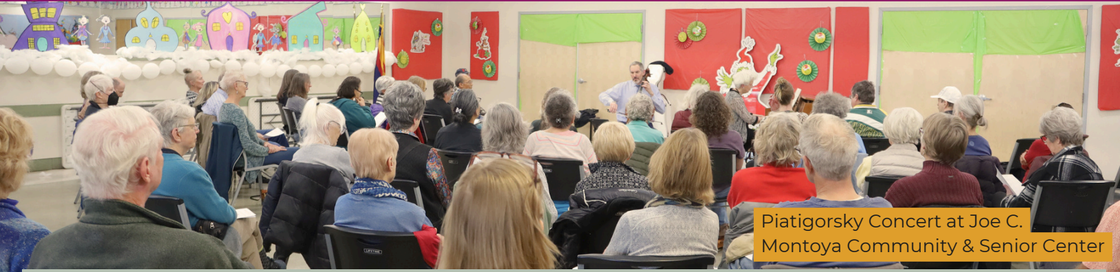
Piatigorsky Concert at Joe C. Montoya Community & Senior Center