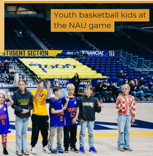
Youth basketball kids at the NAU game

Youth Basketball hosted its first Jr. Suns Night at NAU with a great turnout. Kids wearing their Jr. Suns jersey got in free, and parents received discounted tickets. Players were invited onto the court to be recognized. The NAU Men's Basketball team also supported our Skills and Drills Day, so it's great to cheer them on and see them play!