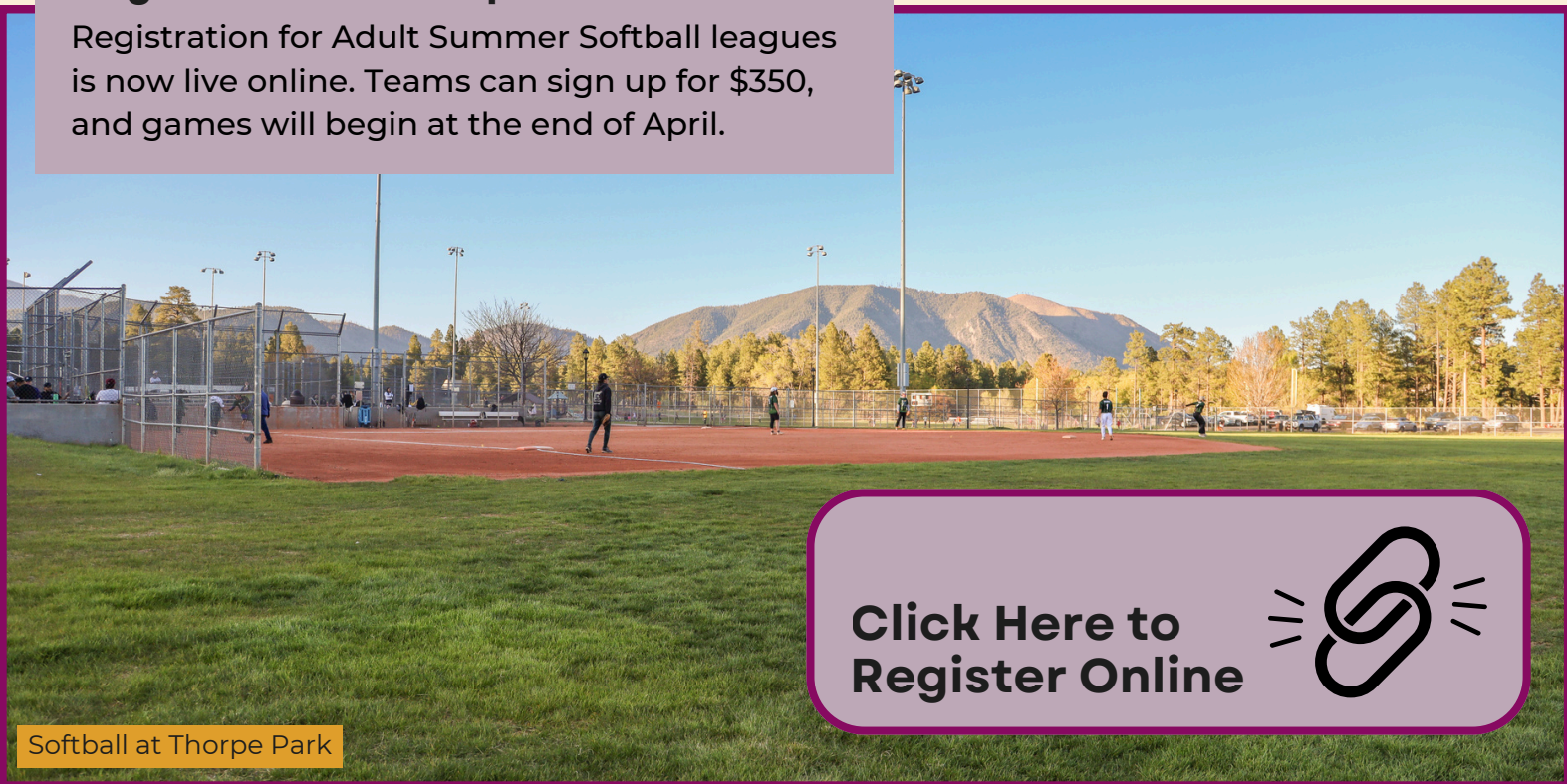
Softball at Thorpe Park

Registration for Adult Summer Softball leagues is now live online. Teams can sign up for $350, and games will begin at the end of April.