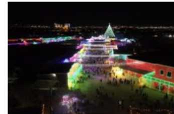
Seven Million Lights. One Wild West Christmas.