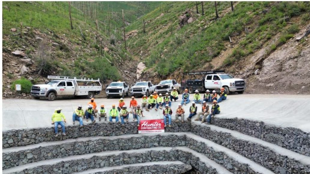
Inner Basin Waterline Rehabilitation, City of Flagstaff — an award-winning rebuild restoring 46 sites across 13 mountain miles, using trenchless repairs, slope stabilization, and drone inspections to bring potable water back after wildfire damage.