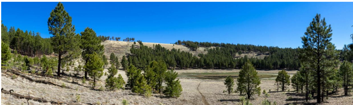
Top: 1875. Middle: 2004. Bottom: 2022