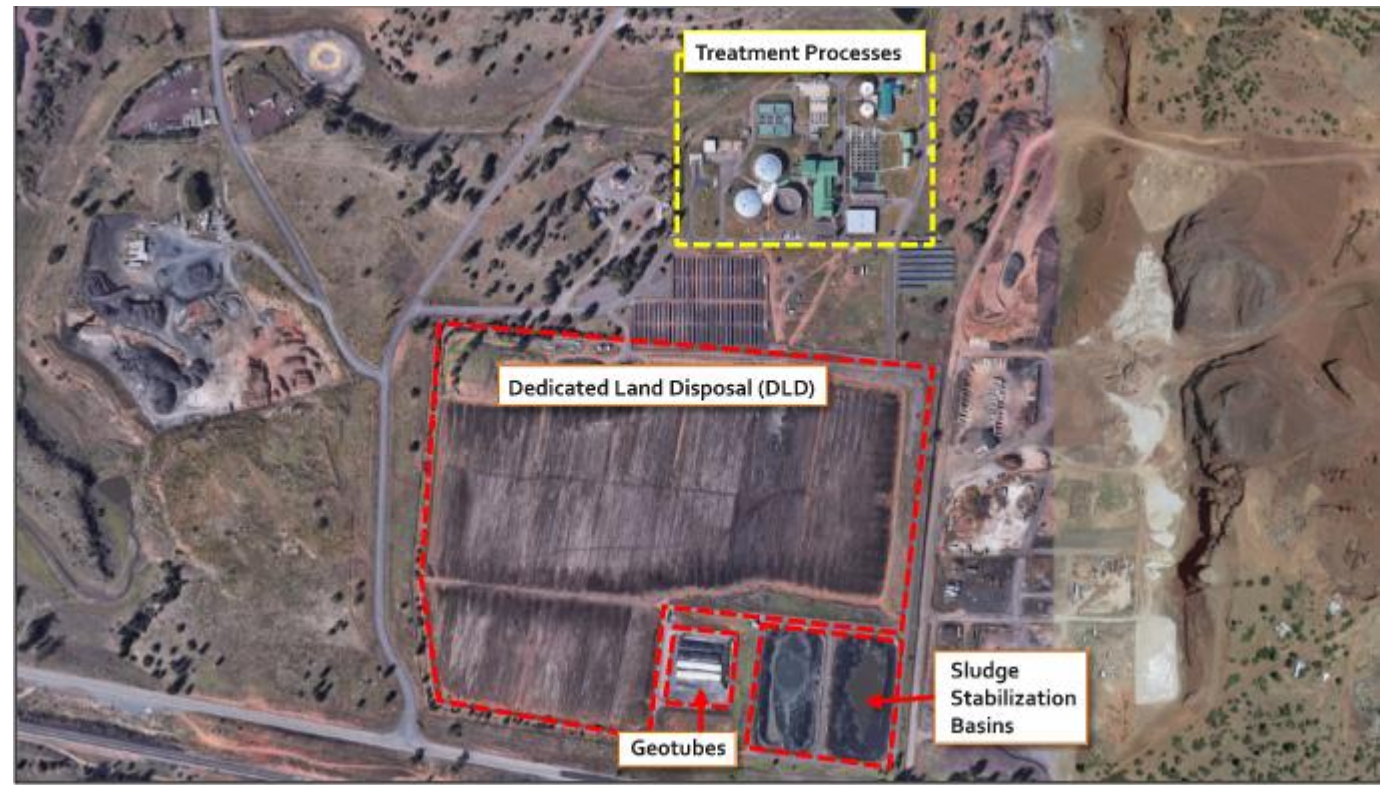
Figure 1.6 WHWRP Existing Facilities - Overall Site Plan