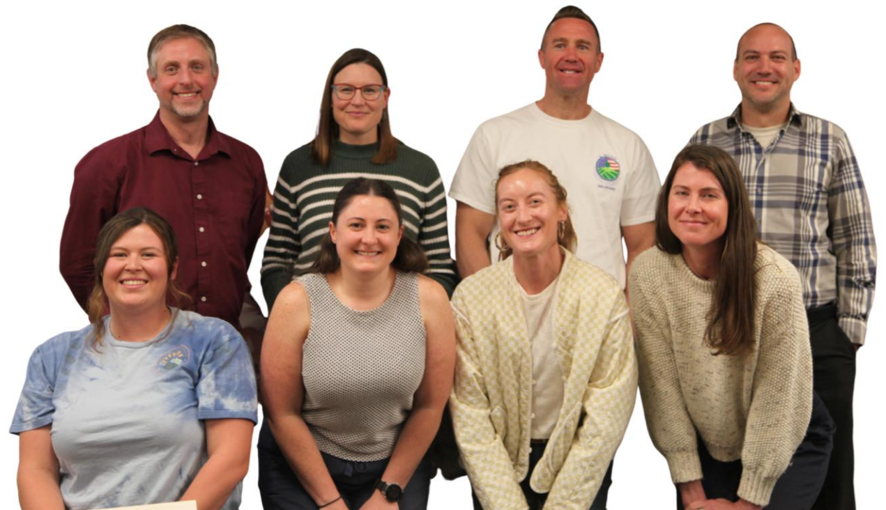
2026 Green Business Boot Camp Graduates