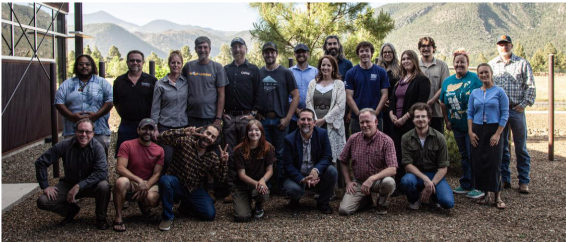
2025 Green Business Boot Camp