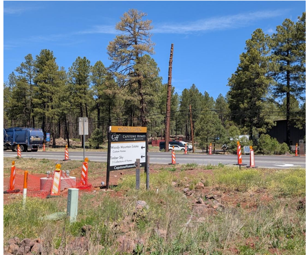
Pole Foundations Complete and meter pedestal set