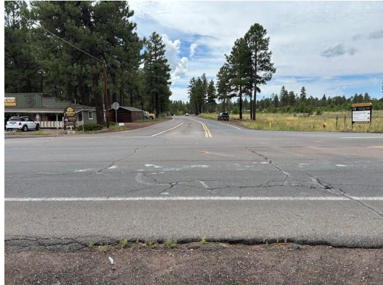
Looking south towards Woody Mountain Rd.