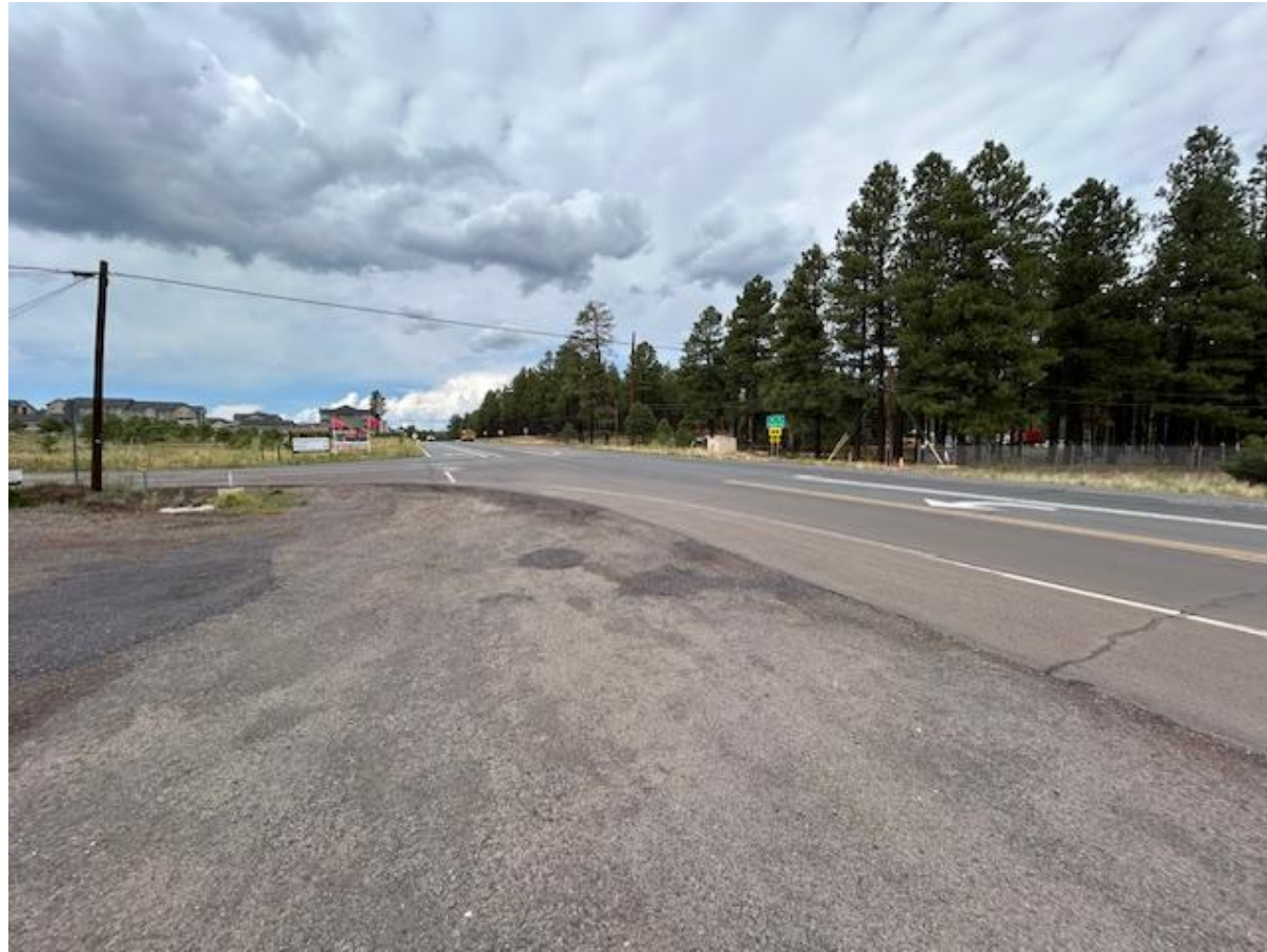
Looking west along W. Route 66