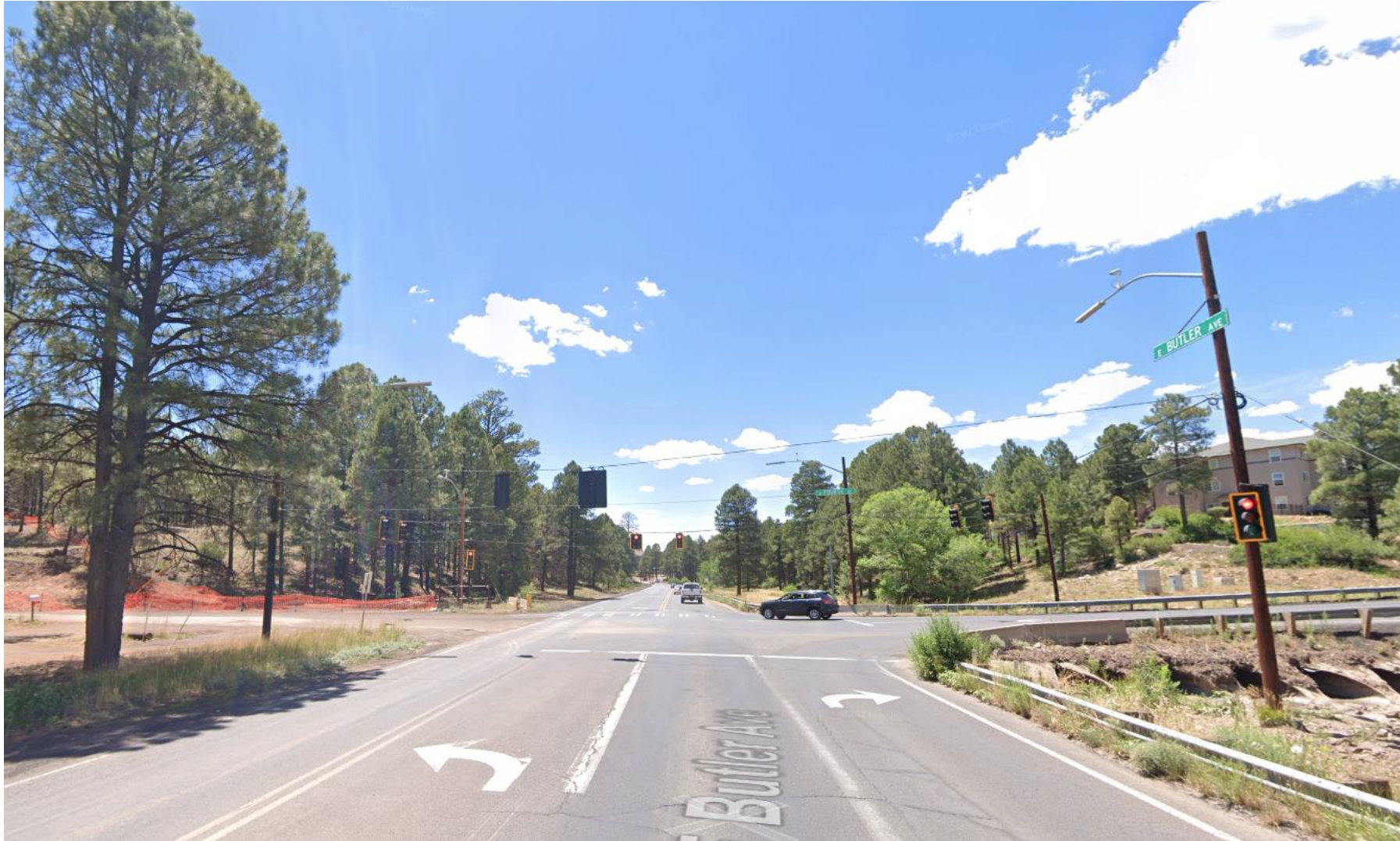
Butler Ave & Fourth Street Span-Wire Signal