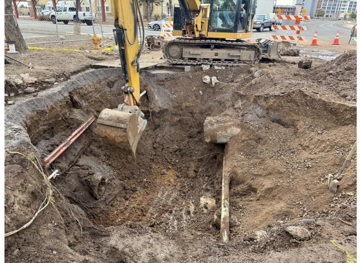
Wednesday: Site of main break shows proximity of utilities to water main, including natural gas directly above and to the right, and fiber optics and irrigation above and to the left.