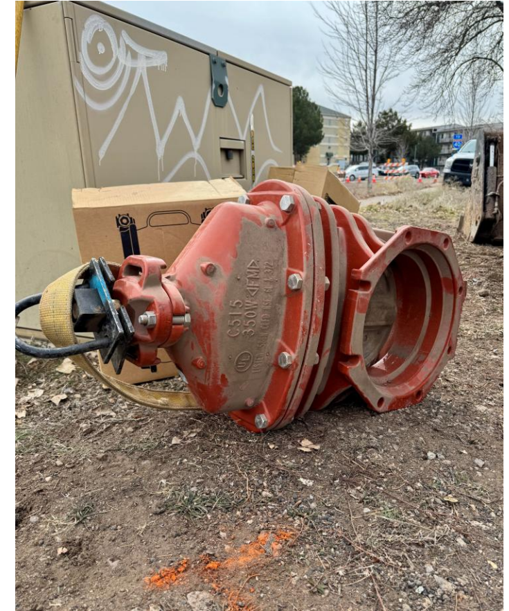
Wednesday: Valve waiting to be installed restores water to affected customers while also isolating the break location for repair.