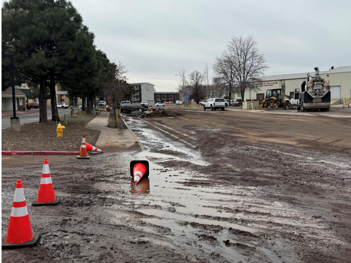
Wednesday: Vantage point of two sites from 50 yards away shows extent of impact.