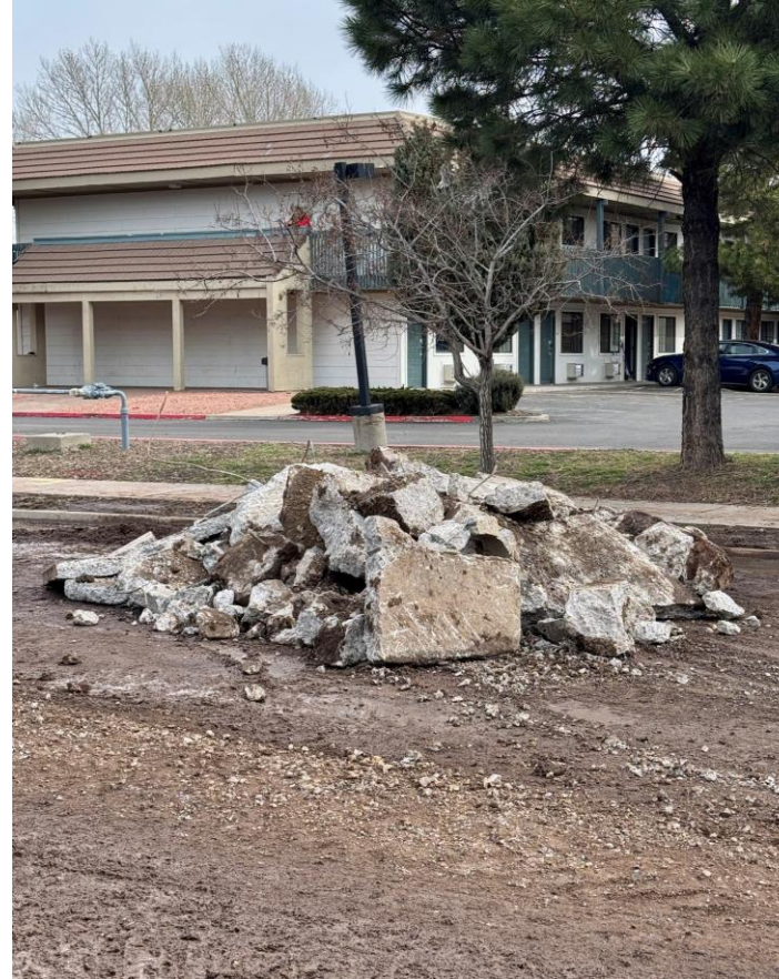
Wednesday: Debris of the stormwater collection basin that had to be removed before water main could be repaired.