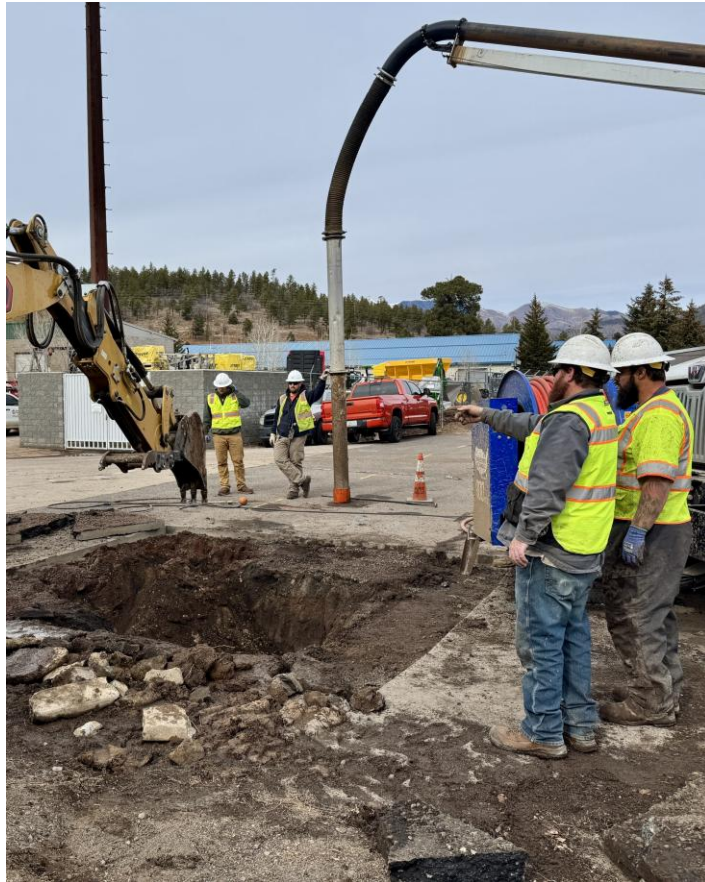
Wednesday: City Water Services crews prepare a 2 nd site to install valve that returns flow to remaining properties.