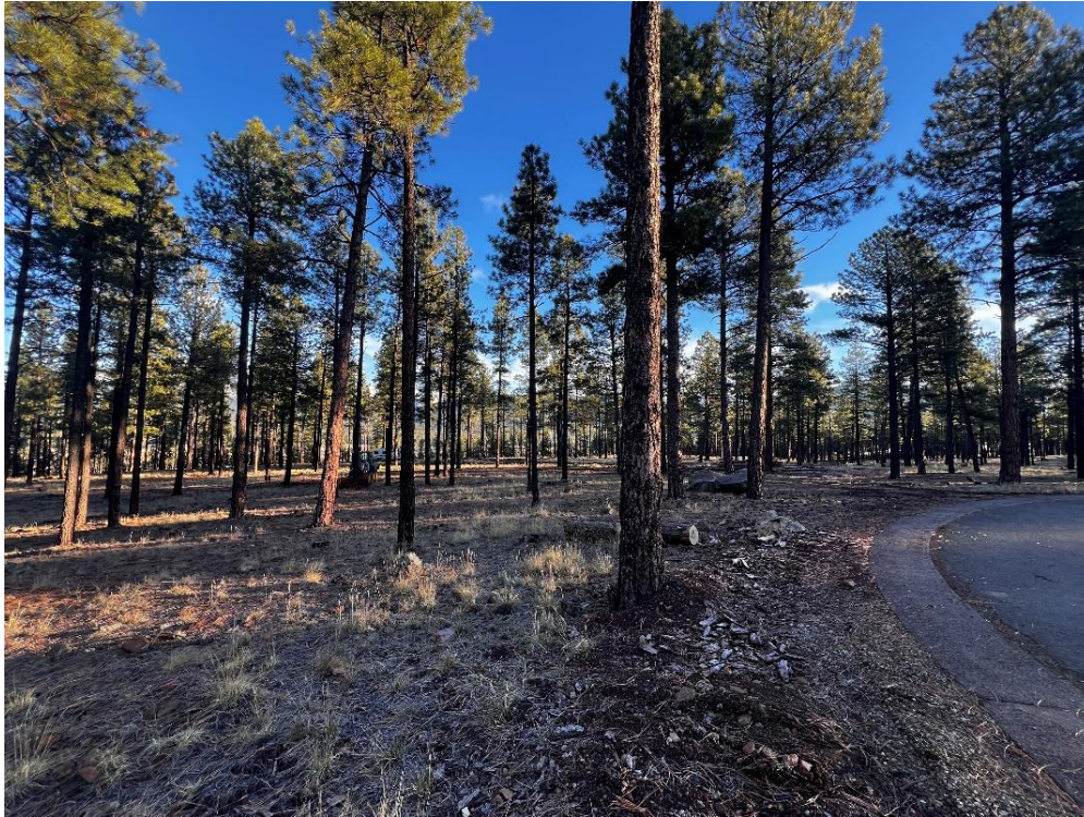
Photograph 1. Project overview from southwest corner of property, facing northeast.