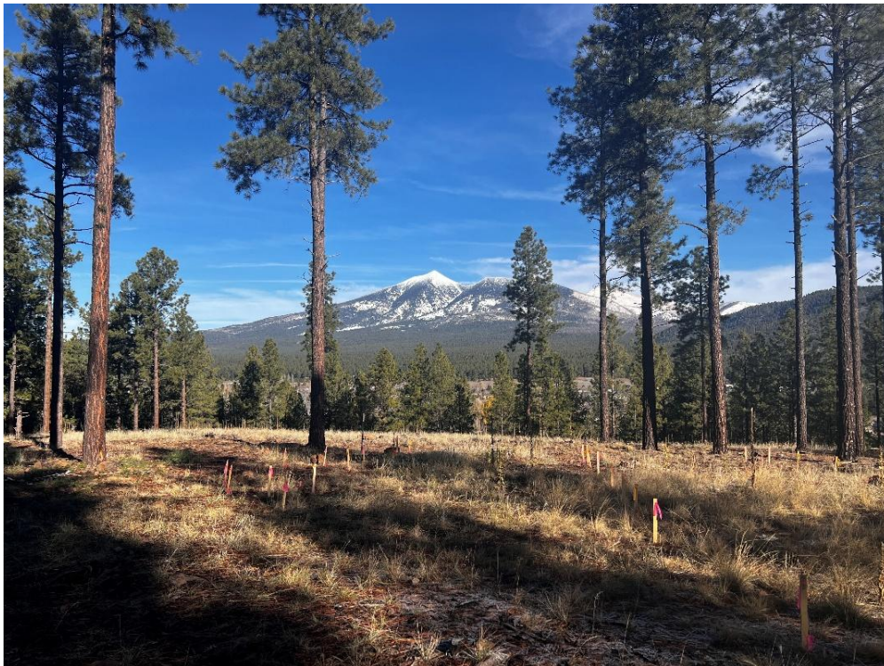
Photograph 2. Project overview with Humphreys Peak in the background, facing north.