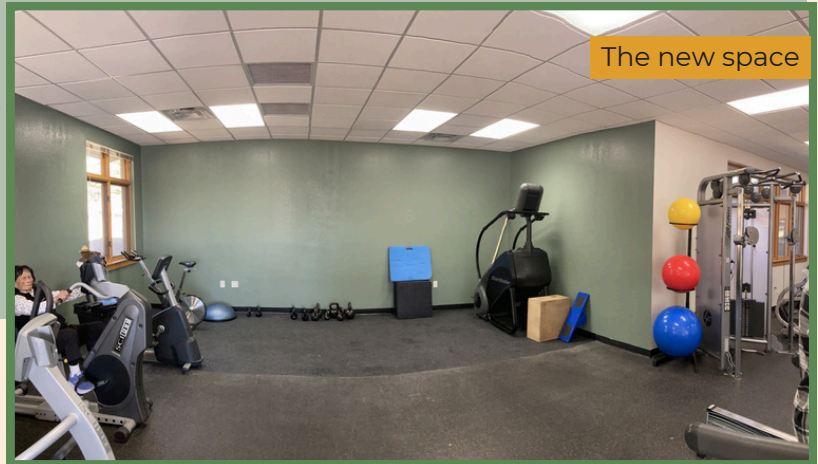
The new space

Staff at the Joe C. Montoya Community & Senior Center partnered with Facilities Maintenance to transform an old office and storage room into an open workout area for stretching, bodyweight exercises, and cardio equipment. This upgrade creates a welcoming area for residents to focus on health and wellness—and it was made possible entirely through generous community donations.