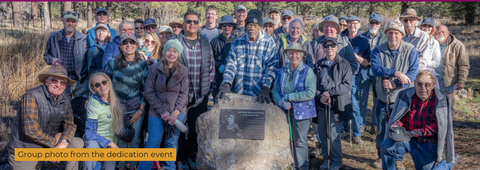
Group photo from the dedication event