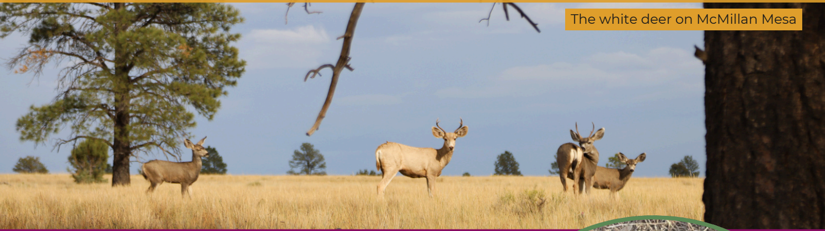
The white deer on McMillan Mesa