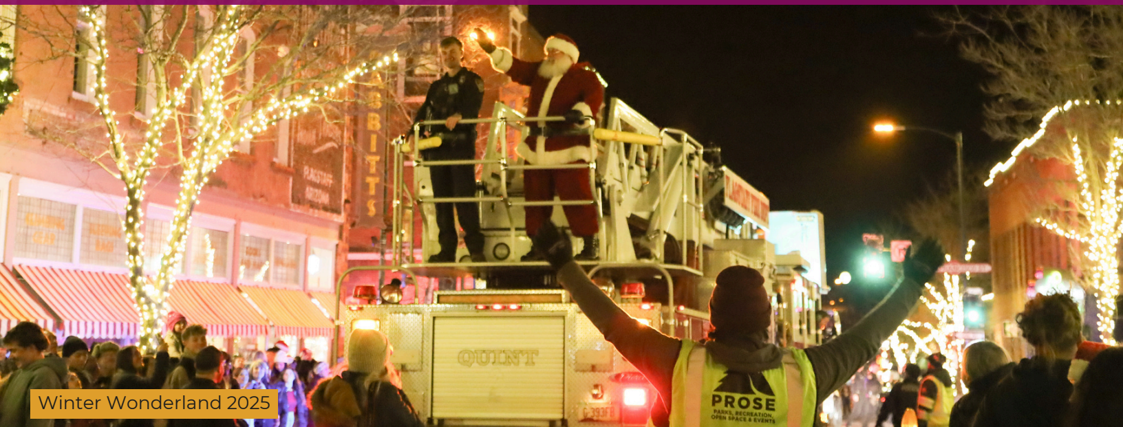
Winter Wonderland 2025