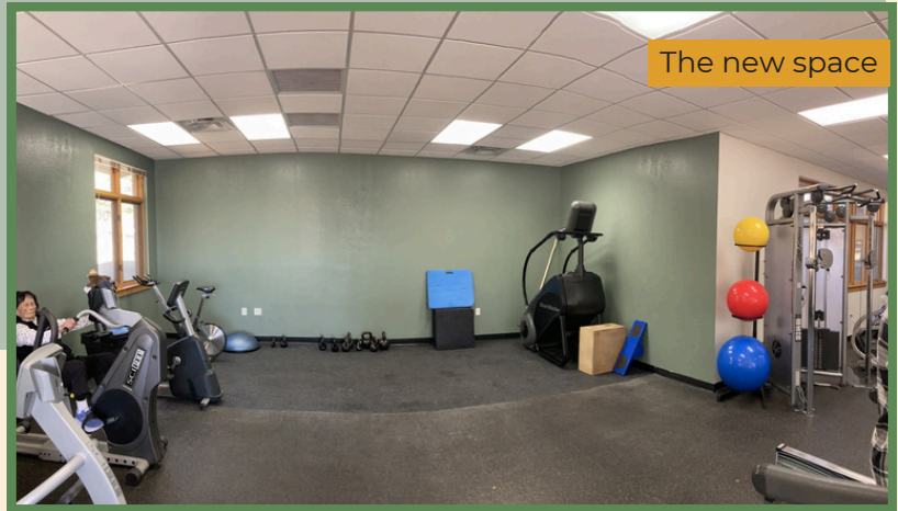
The new space

Staff at the Joe C. Montoya Community & Senior Center partnered with Facilities Maintenance to transform an old office and storage room into an open workout area for stretching, bodyweight exercises, and cardio equipment. This upgrade creates a welcoming area for residents to focus on health and wellness—and it was made possible entirely through generous community donations.