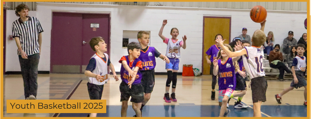
Youth Basketball 2025