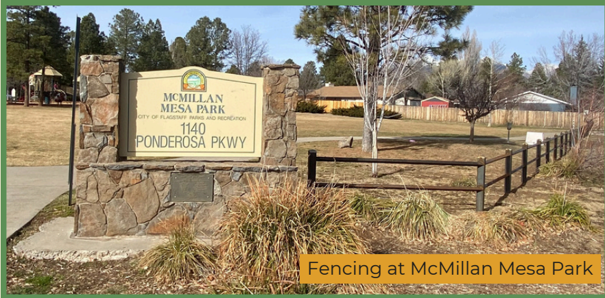
Fencing at McMillan Mesa Park