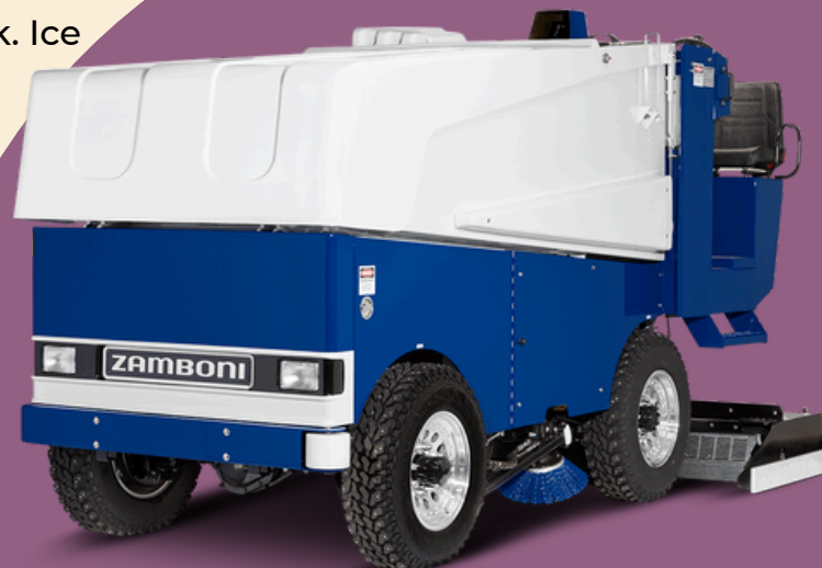
New Electric Zamboni

Jay Lively Activity Center received a new 552AC Electric Zamboni. Rink staff installed the FastICE system and coordinated with Facilities Maintenance to mount the Laser Leveling System inside the ice rink. Ice rink staff recently took the Zamboni on the ice and had a successful first ice cut! The new EV Zamboni supports the City of Flagstaff's Carbon Neutrality Plan by reducing emissions and improving indoor air quality. Jay Lively Activity Center is the first municipal and second ice rink in the state of Arizona with an electric Zamboni.