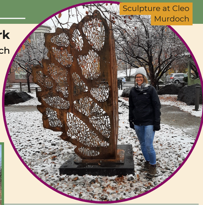
Sculpture at Cleo Murdoch