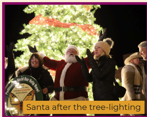
Santa after the tree-lighting

This year's Winter Wonderland and Tree Lighting event was an incredible success, drawing approximately 18,000 attendees throughout the day! The Events and Marketing team led the coordination and on-the-ground efforts, but this celebration wouldn't have been possible without the amazing support from our Recreation staff, Parks team and other partners. From craft tables and bounce houses to the obstacle course, scavenger hunt, hot cocoa stations, and seamless setup and cleanup—everyone's hard work made everything run smoothly. A heartfelt thank you goes out to all partners and supporters of this event including Discover Flagstaff, the Downtown Business Alliance, Bigfoot BBQ for donating hot cocoa, Flag Tag AZ, and all who joined in to make this event unforgettable.