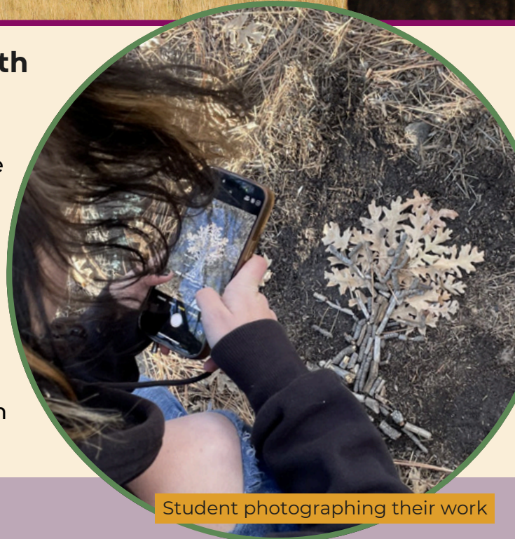
Student photographing their work

Students wrapped up the Science Communication Through Art project this quarter by exploring creative ways to connect art and nature. They worked with watercolors, pastels, and colored pencils while studying artist Andy Goldsworthy's work. Activities included making sound maps, creating textured pieces, and finishing with a visit to McMillan Mesa to design ephemeral art using natural materials. One student crafted an oak tree from Gambel oak leaves and sticks, photographed it for her portfolio, and then returned the items to their natural state.