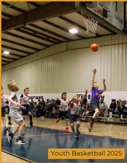
Youth Basketball 2025