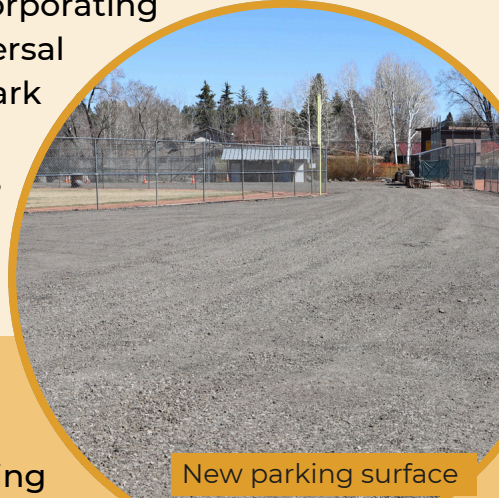
New parking surface

Parks has been collaborating with the Economic Vitality team to develop new, uniform signage for all city parks. The updated signs will improve accessibility by incorporating QR codes and universal symbols, making park rules clearer and easier for all visitors to understand.