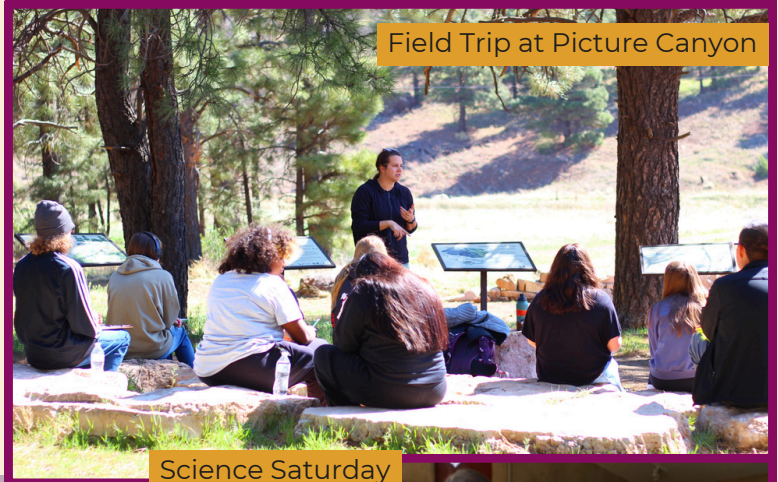
Field Trip at Picture Canyon