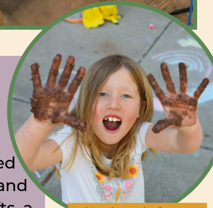
Dirty hands from a STEAM project

Spring Break activities at Hal Jensen Recreation Center were a hit, drawing strong participation throughout the week. Youth enjoyed daily games like whiffleball, dodgeball, kickball, and basketball, along with arts and crafts, a cooking class, and a movie in the gym. Highlights also included field trips to Jay Lively for ice skating, PuttTek for mini golf, and Starlite Lanes for bowling.