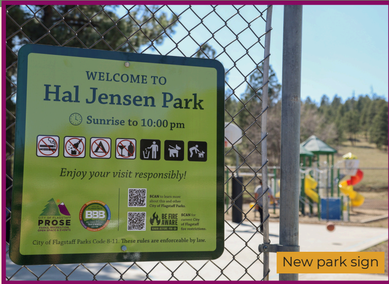
New park sign