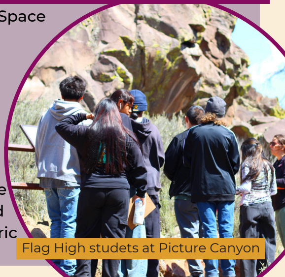
Flag High students at Picture Canyon