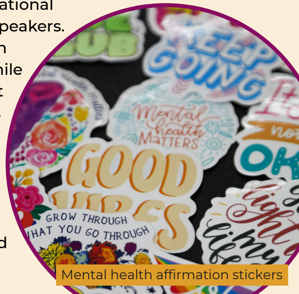
Mental health affirmation stickers

on, the experience provided valuable lessons that will help us strengthen engagement and elevate next year's summit. We are excited to build on this foundation and continue creating meaningful opportunities for Flagstaff teens. We extend a heartfelt thank-you to our incredible community partners: Native Americans for Community Action, Northern Arizona University, CAVIAT, Coconino County, Tynkertopia, and the Coconino Coalition for Children & Youth.