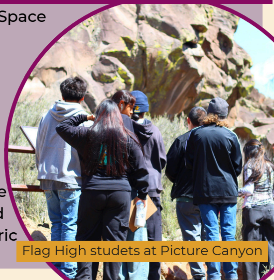
Flag High students at Picture Canyon