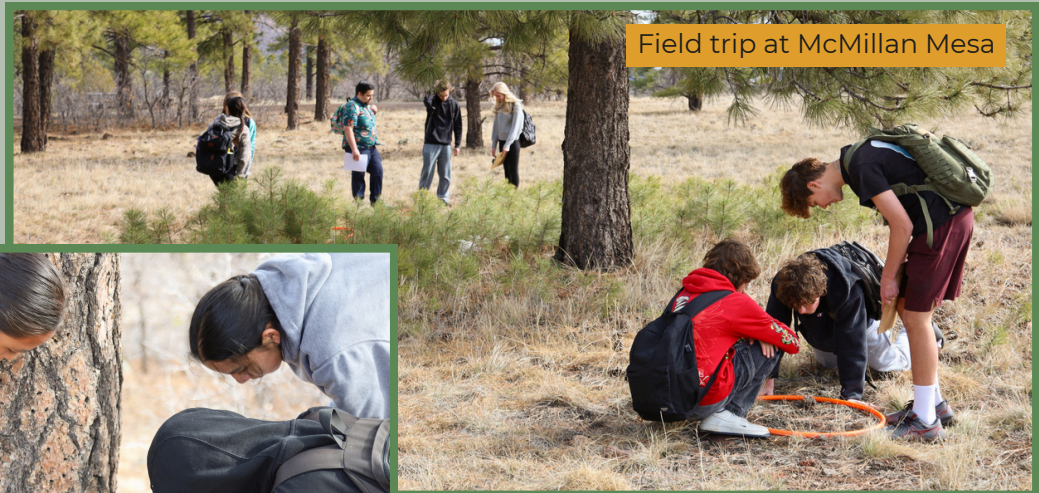
Field trip at McMillan Mesa