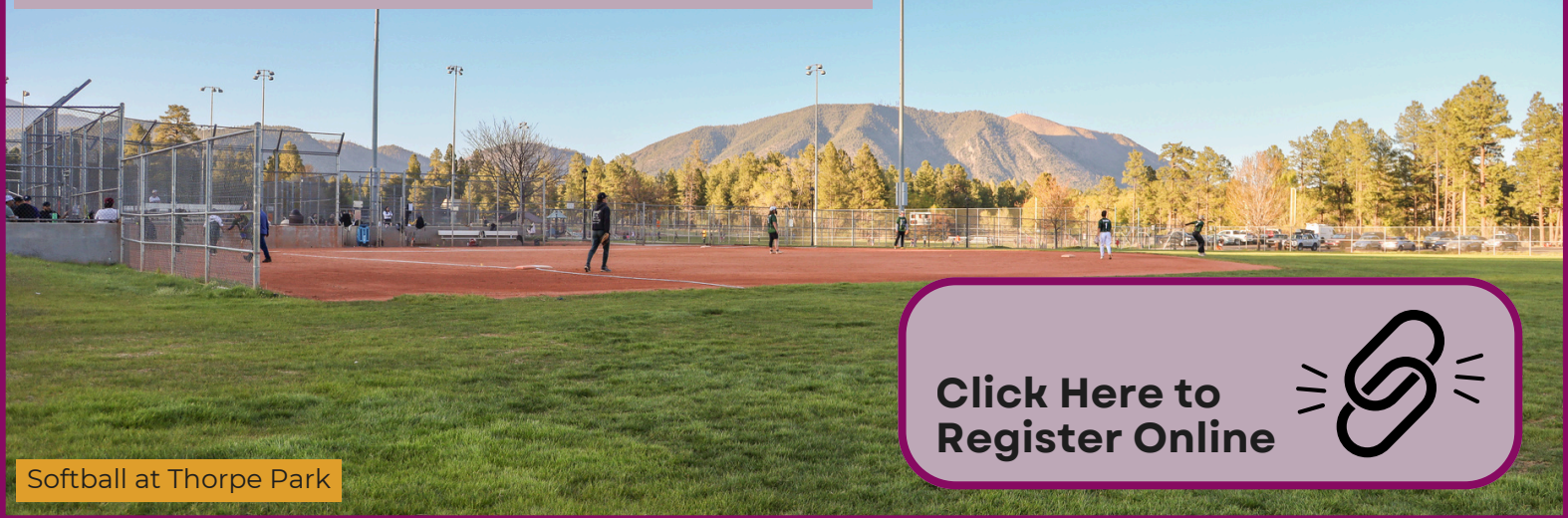
Softball at Thorpe Park

Registration for Adult Summer Softball leagues is now live online. Teams can sign up for $350, and games will begin at the end of April.