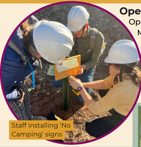
Staff installing 'No Camping' signs

Volunteers also took advantage of a break in the weather to remove old tires, ceramic floor tiles, and other debris from the interior of Picture Canyon, helping to keep the area clean and welcoming for visitors.