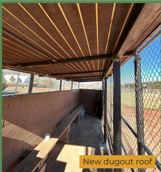
New dugout roof

The Parks team recently completed the roof replacement project on the dugouts at the Continental Sports Complex, removing the old wooden structures and installing durable, steel-reinforced roofs built to withstand the elements.