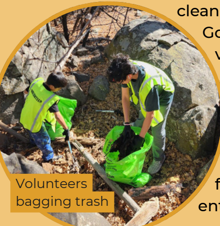
Volunteers bagging trash

Hal Jensen Recreation Center partnered with the city's Sustainability Stewards program to host a volunteer cleanup at the Thorpe Park Disc Golf Course. Five kids volunteered their afternoon and enjoyed exploring the park as they collected litter. After the clean-up, participants were treated to pizza and soda as a thank-you for their hard work and enthusiasm.