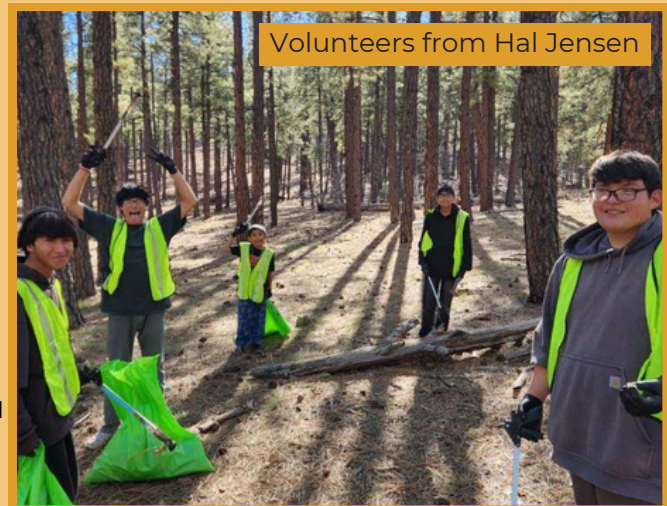
Volunteers from Hal Jensen