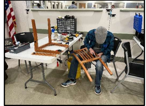
Photo: Fixer at Fix-It Clinic.