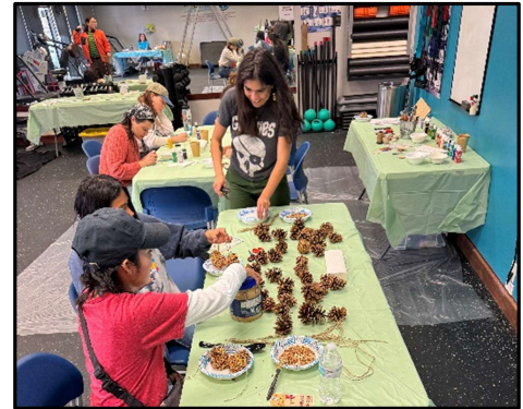
Photo: Participants at the Garden Winterization Workshop