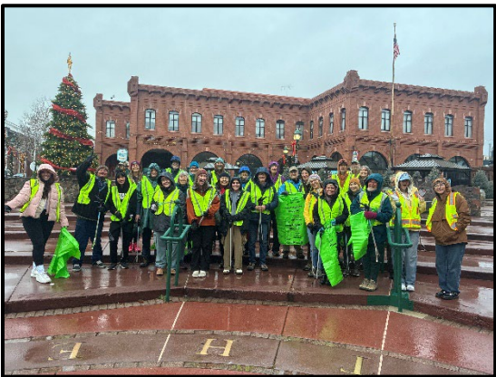
Photo: Pinecone Drop Cleanup Group Photo