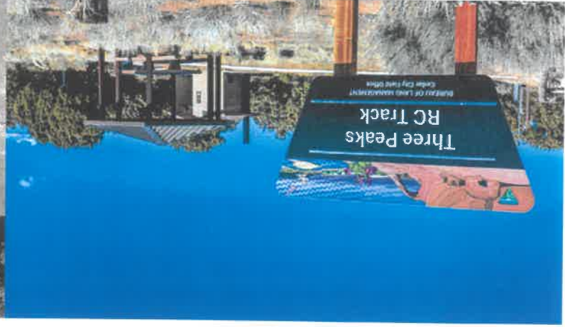
Three Peaks RC Track Cedar City, NM