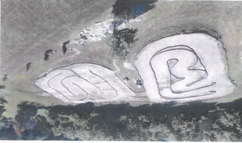
City of Columbia, MO RC Track