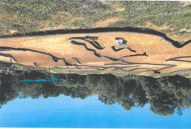
Boone County Parks Department Idlewild Park - Burlington, KY