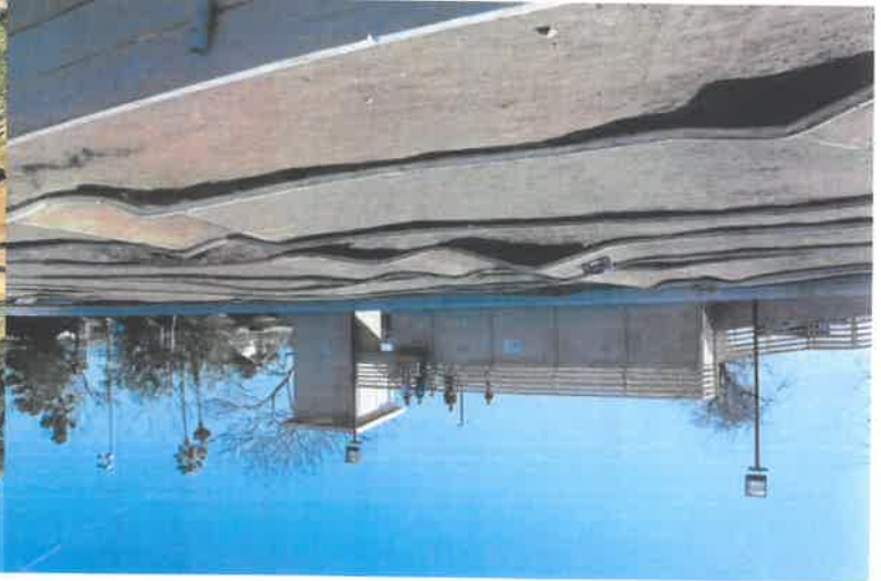
Freedom Park - Camarillo, CA Pleasant Valley Recreation & Park District