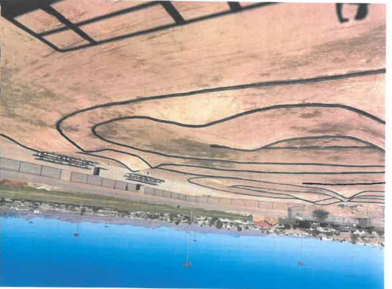
Rotary Park RC Track Bullhead City, AZ