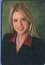
The Honorable Pam Bondi

The Honorable Pam Bondi, Florida Attorney General