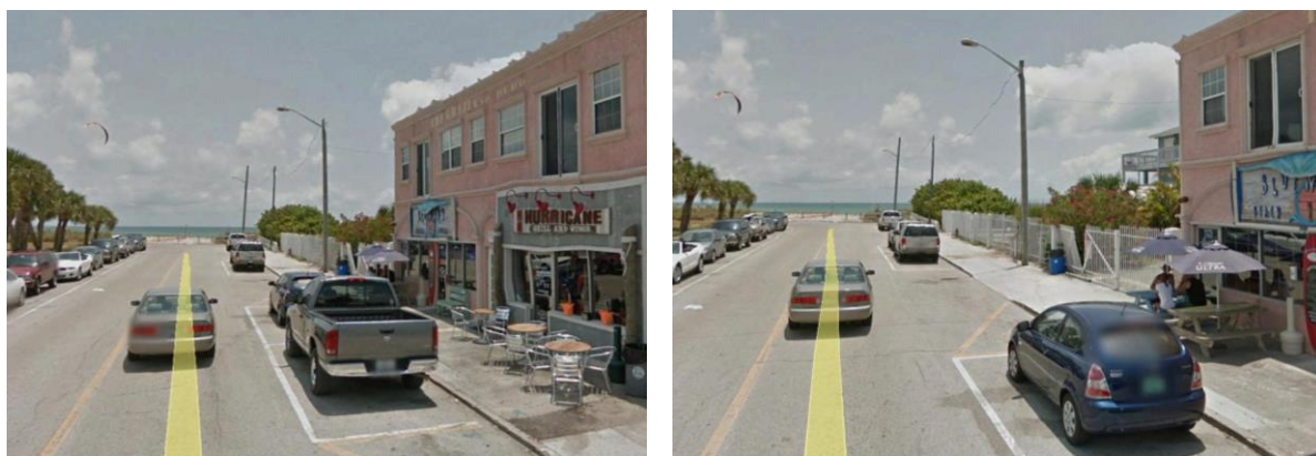
Figures 2 & 3

Further, the awning will enhance and emphasize the entrance to the resort building as provided in Sec. 22-59(g)(2)a , “Buildings shall have architectural features such as porches or roof overhangs that delineate or emphasize entrances. Covered entrances shall be proportioned to human scale and follow logic of design relative to the building. This entrance shall face the public right-of-way, be well-defined architecturally and readily visible to pedestrian and vehicular traffic.” The awning will make the building more visible to pedestrian and vehicular traffic. As the site currently exists, the Inlet Beach Resort main building is well hidden (Figure 2) behind the building to the west due to the proximity of its setback location. It is not until you are almost in front of the site, do you see it. (Figure 3)