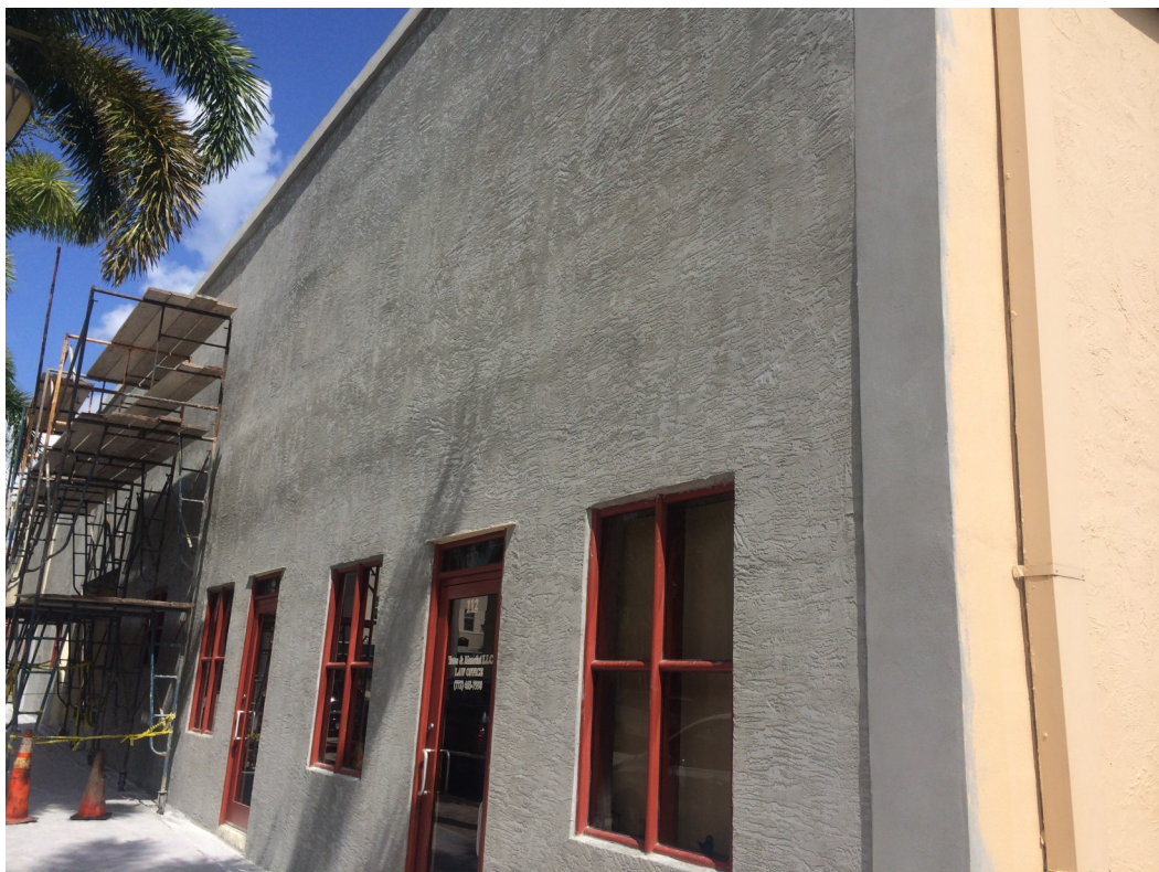
Current Progress of Stucco Repair/Replacement on Southern Façade