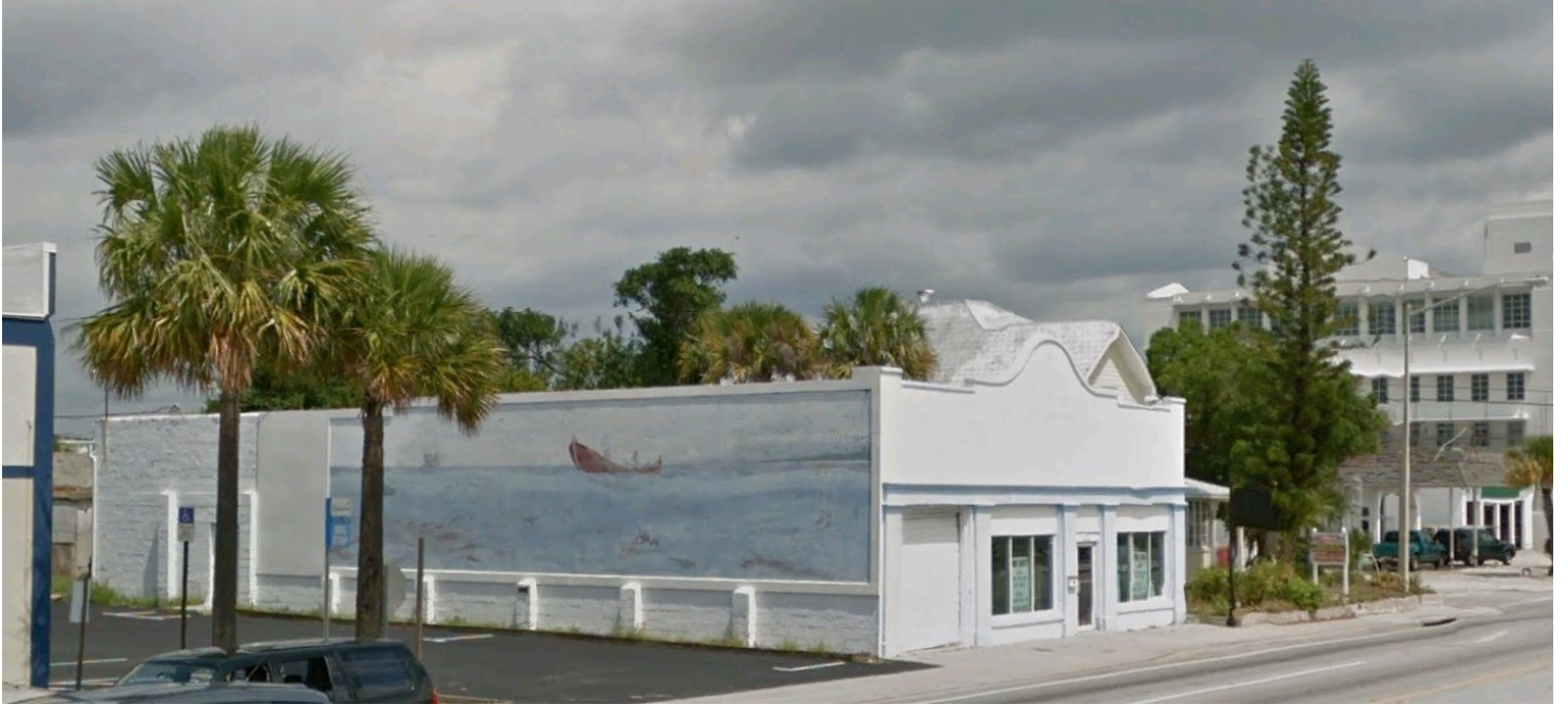
303 S US 1

Mural was painted over between 2011-2012