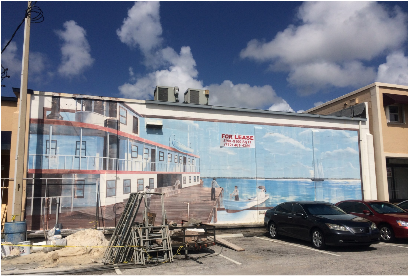
Existing Mural at Rear of 102 N 2nd Street— Painted 1995