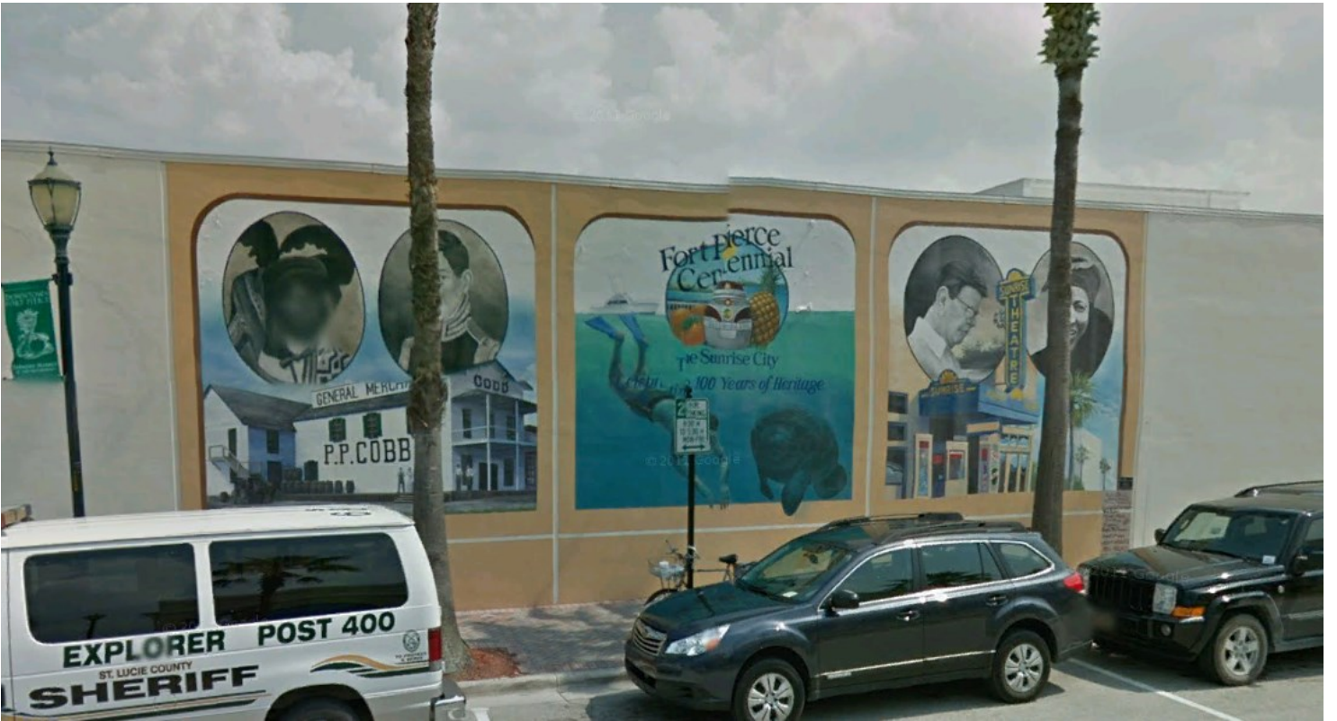
Avenue A, Between N 2nd St. & N Indian River Dr. Mural on Former OPS Building— Currently deteriorating

Mural was painted over between 2011-2012