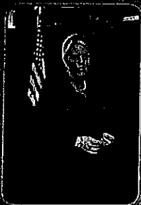
The Honorable Pam Bondi

The Honorable Pam Bondi, Florida Attorney General