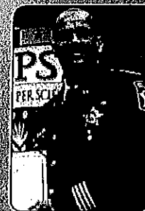
The Honorable David A. Clarke, Jr.