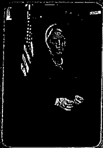
The Honorable Pam Bondi

The Honorable Pam Bondi, Florida Attorney General