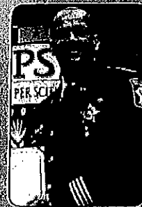
The Honorable David A. Clarke, Jr.

The Honorable David A. Clarke, Jr. has spent the last three-and-a-half decades in law enforcement serving the people of Milwaukee. In 2002, Sheriff Clarke was appointed as the 64th Sheriff of Milwaukee County by Governor Scott McCallum, and later, elected that same year to his first of three, four-year terms. Sheriff Clarke was honored in May 2013, with the Sheriff of the Year Award from the Constitutional Sheriffs and Peace Officers Association for "demonstrating true leadership and courage." Many national organizations and news outlets have interviewed Sheriff Clarke as an expert on law enforcement, Second Amendment, and homeland security issues, including: CNN, Fox News, Glenn Beck, The Washington Times, The Washington Post, National Public Radio, Politico.com, National Rifle Association, Conservative Political Action Conference, and the US Concealed Carry Association.