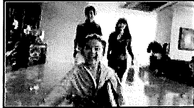
Walt Disney World Resort