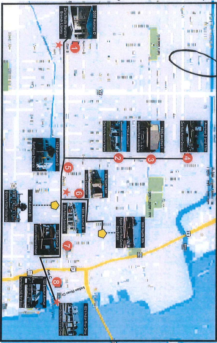
Exhibit A page 2