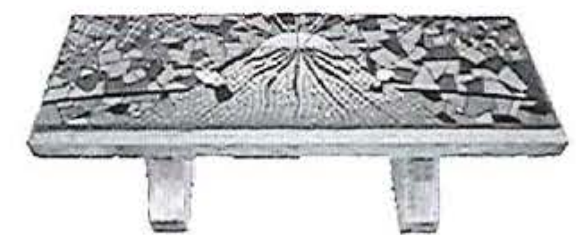
Custom Design Art Tile benches Magnet School of the Arts - four designs