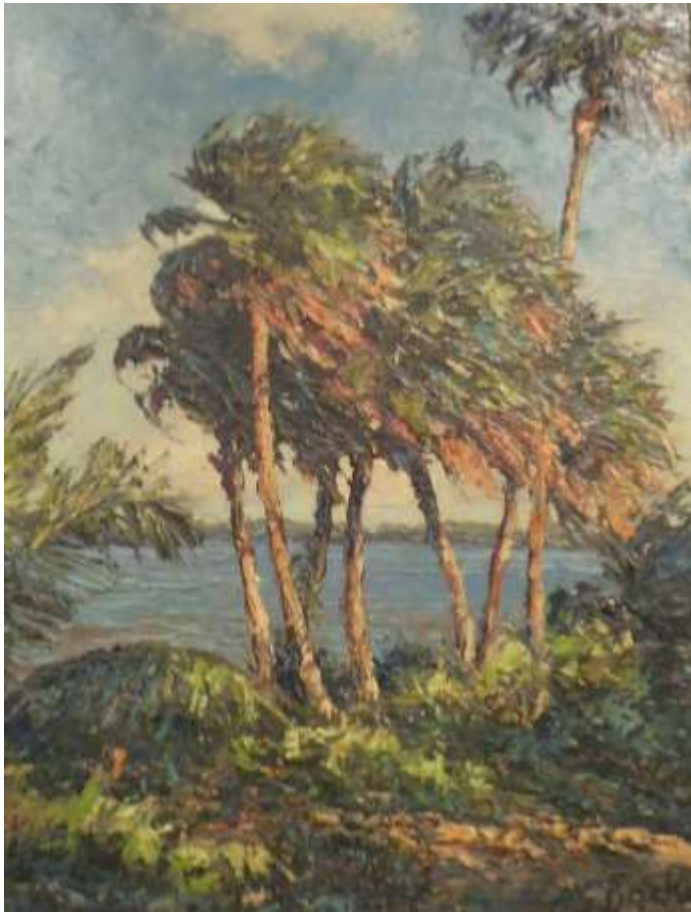
Bluster Day by A.E. Backus, Circa 1955