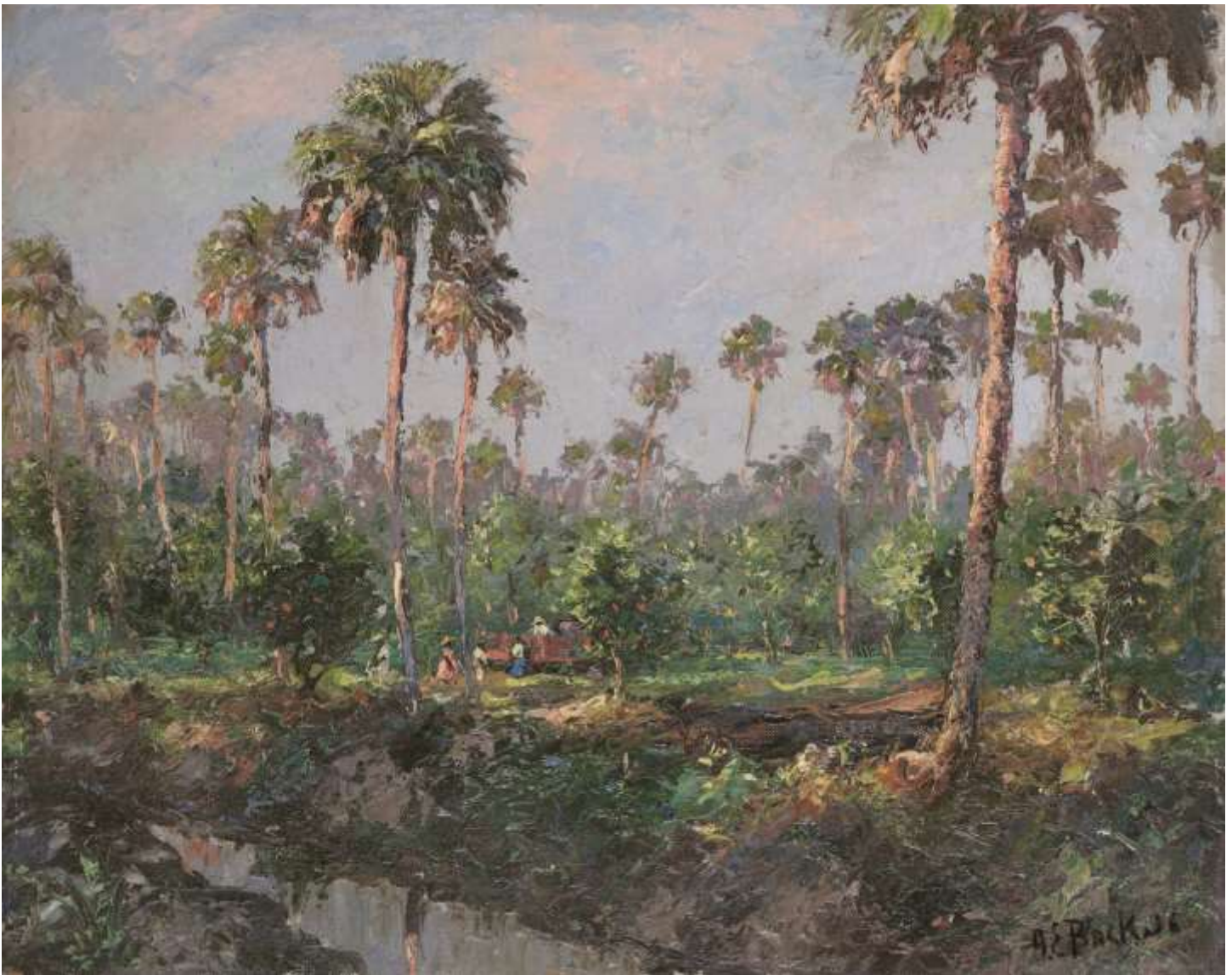
Picking Fruit at Turnbull Hammock, A.E. Backus, Circa 1946