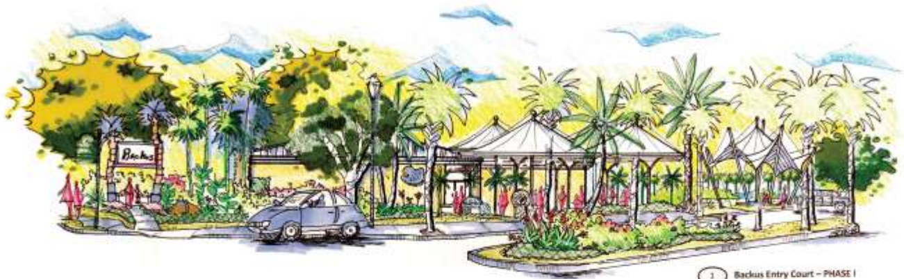
1 Backus Entry Court - PHASE I

Includes (1) Architectural Fascade Structure "Silver Current" Concrete Paving w/Integral Color Artistic Entry Wall Featuring Underlay Glass to Cover Museum Outdoor Seating Featuring New Genre of Instrumental Music each Week Informational Panels of Upcoming Events w/Hours of Operation Seating for Art Classes and Outdoor Events Entry Telephone w/Digital Road Sign for visitors on Sign Expansion of Existing Museum Exhibit Building