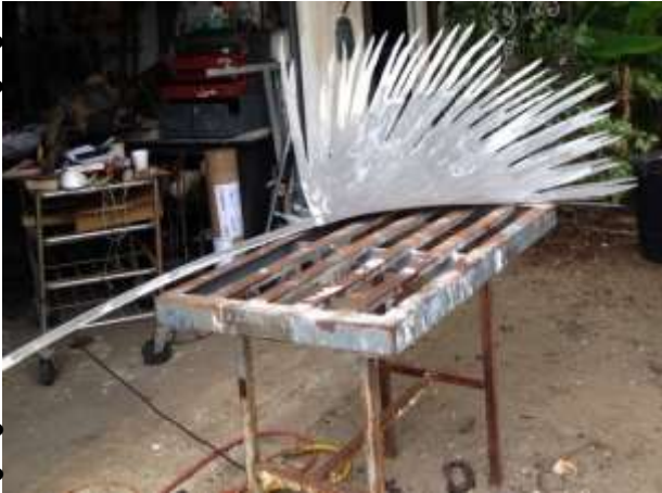
Prototype Aluminum Palm Frond; Design Phase