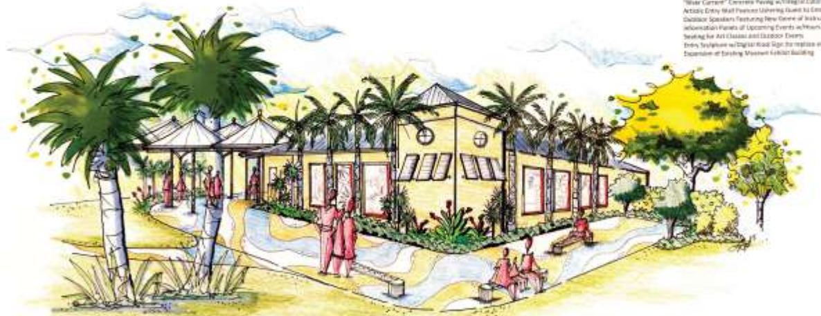
2 Landscape Mural Plaza - PHASE I

Includes (1) Architectural Fascade Structure "Silver Current" Concrete Paving w/Integral Color Artistic Entry Wall Featuring Underlay Glass to Cover Museum Outdoor Seating Featuring New Genre of Instrumental Music each Week Informational Panels of Upcoming Events w/Hours of Operation Seating for Art Classes and Outdoor Events Entry Telephone w/Digital Road Sign for visitors on Sign Expansion of Existing Museum Exhibit Building