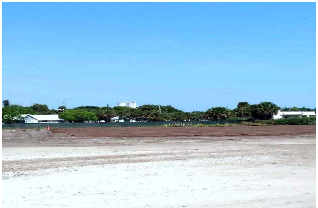
HD King Property - 2015 Area Finished Backfill - March 25, 2015