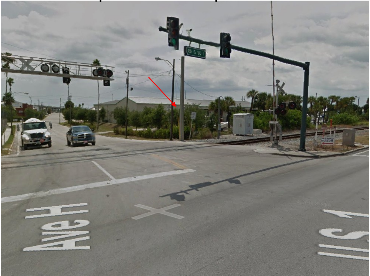
Facing Southeast—Intersection of US Highway 1 & Avenue H