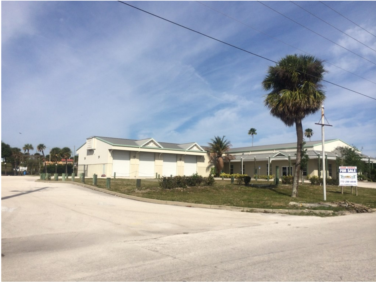
Present Site Photo—From North 2nd Street