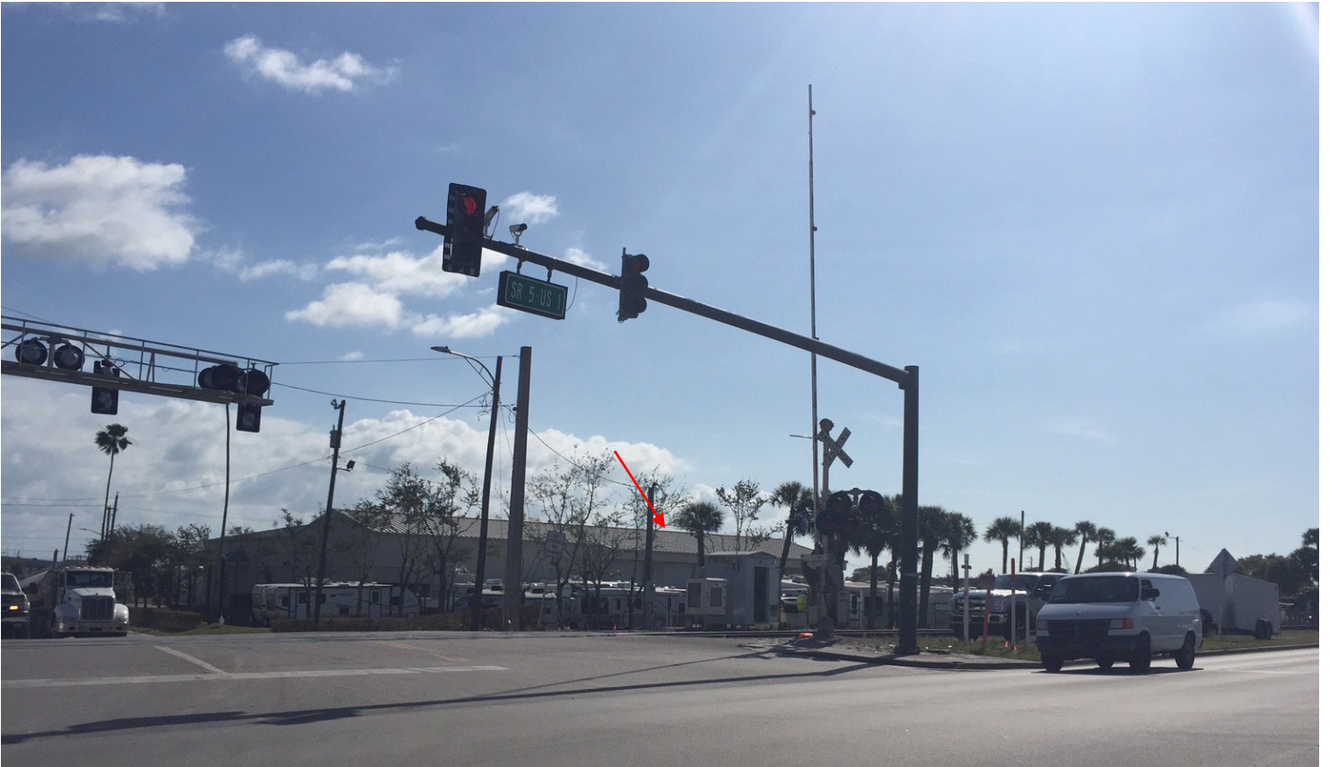
Facing Southeast—Intersection of US Highway 1 & Avenue H