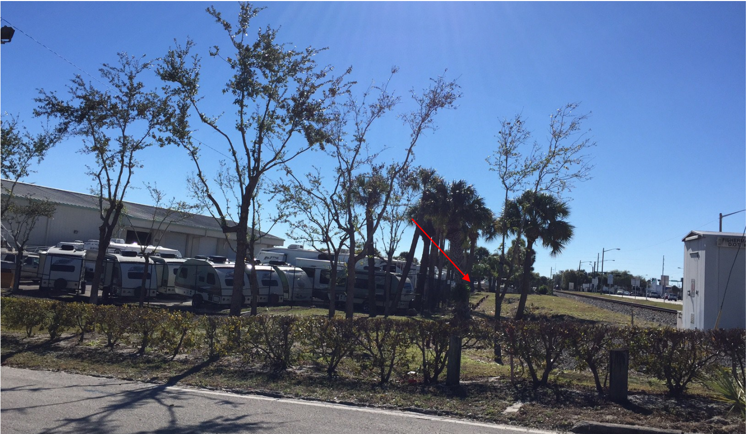
Facing South—Avenue H