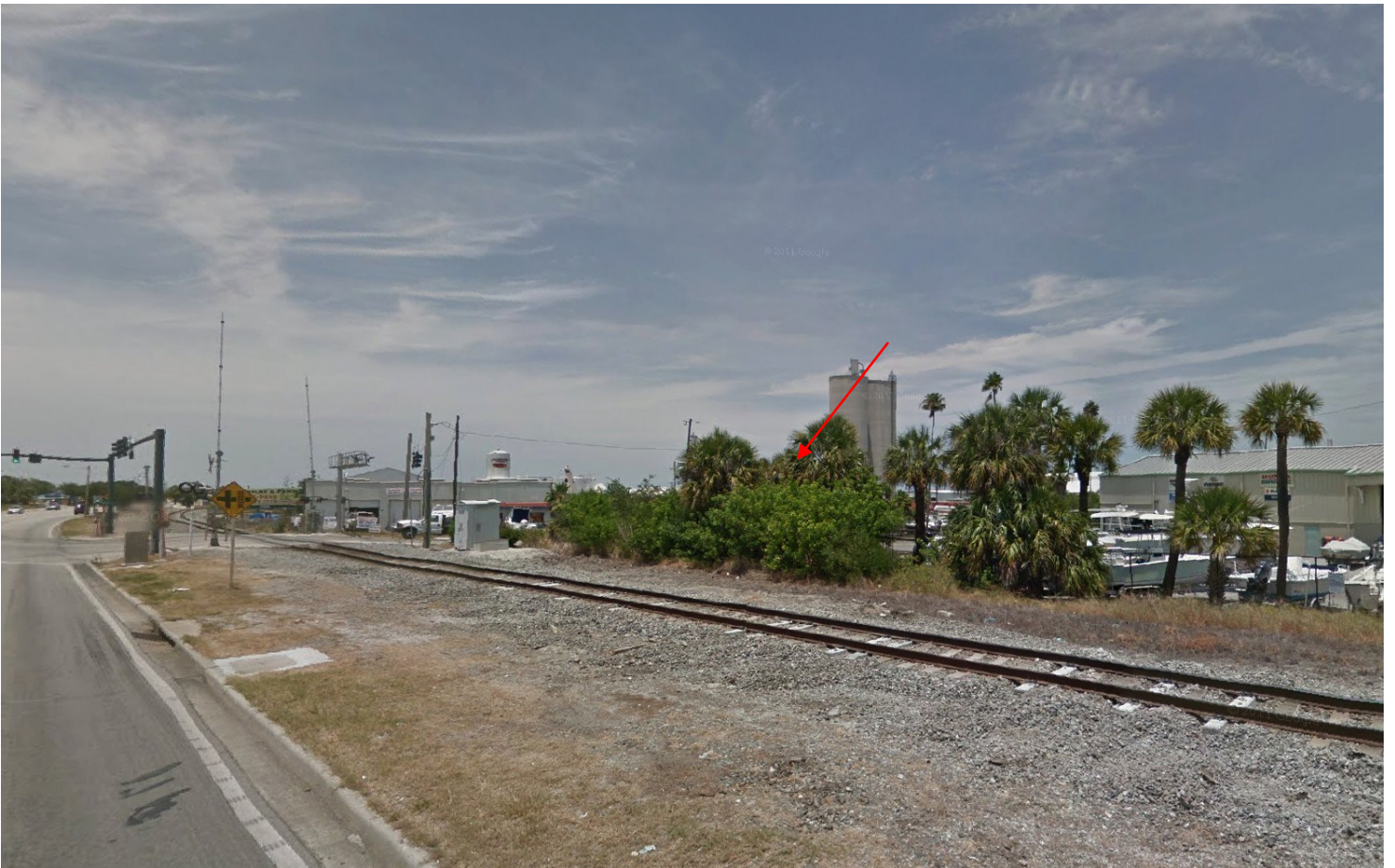
Facing Northeast – US Highway