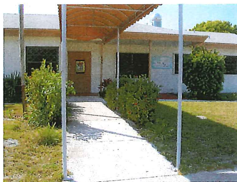
809 N. 9th Street