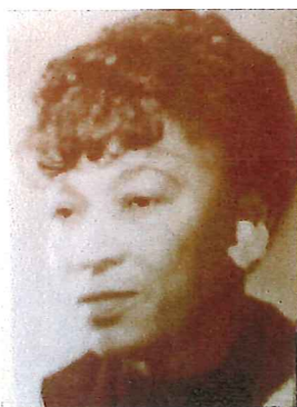
Zora Neale Hurston

In the early eighties, the welfare home closed its door only to reopen as the SLC Helping Hand Neighbors Senior Citizens Center. A place where seniors received breakfast, lunch, and six hours of recreational fun in a safe place with others of their piers. As of today, seniors and the disable come for meals and to socialize. However, they are not the only ones who enjoy coming to the center. Students and visitors also drop by to see an exhibit of the famous author, now on display. Today visitors from Connecticut, New Jersey, Nevada and various parts of Florida, stop in to see the place were Zora Neale Hurston spent her last days.