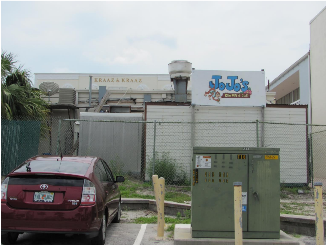
East Elevation - After Redevelopment & with Proposed Canopy