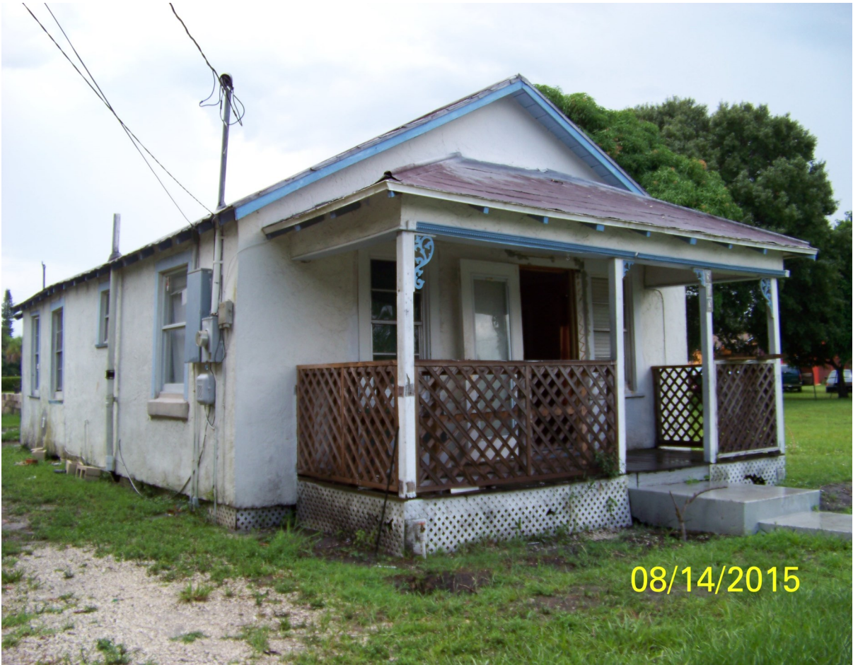
Current Site Photos