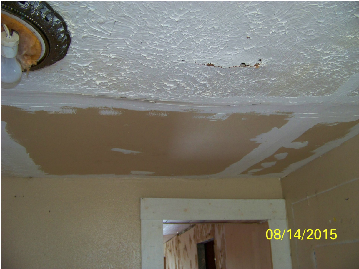
Current Site Photos