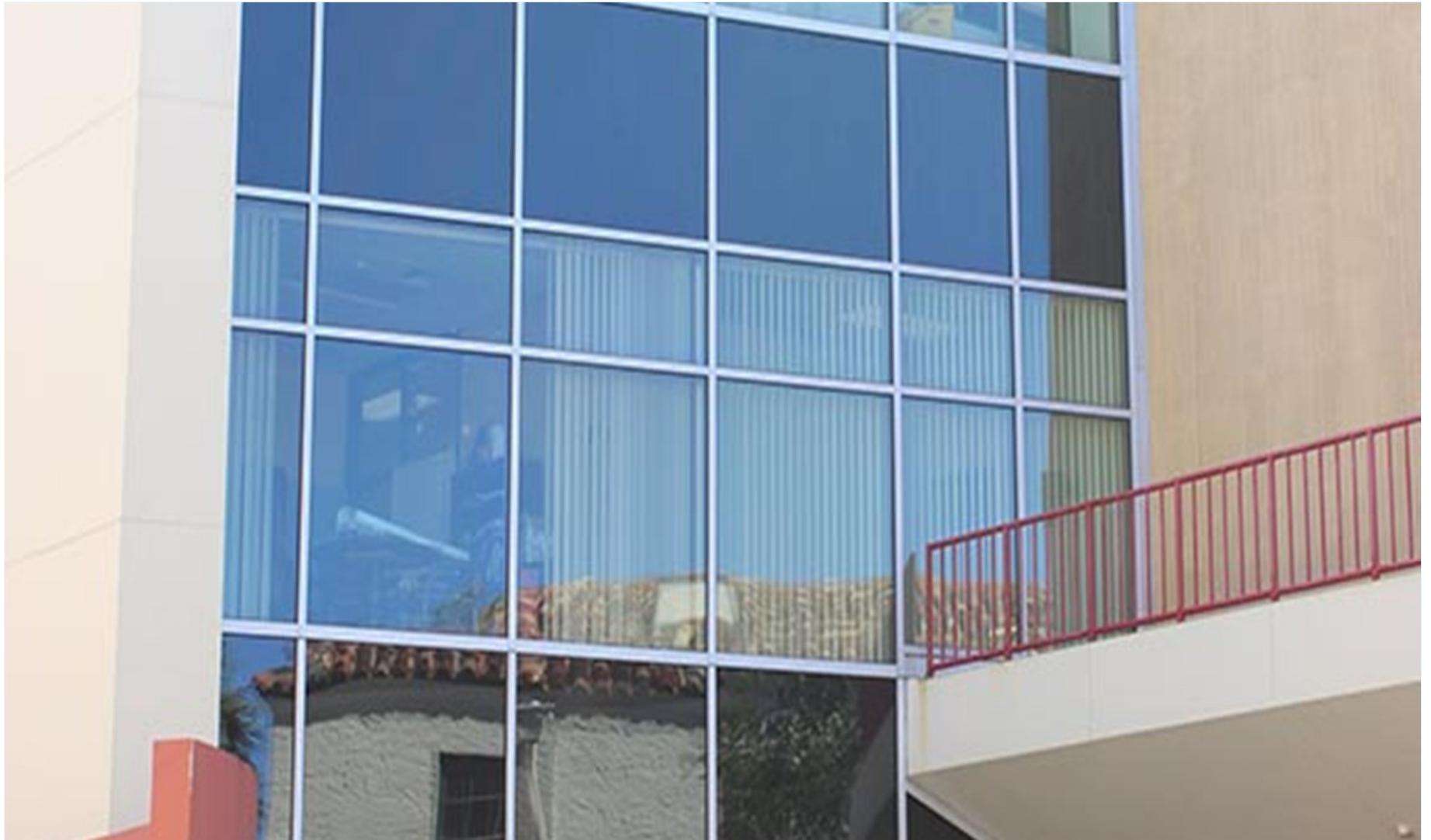
City Hall Side View