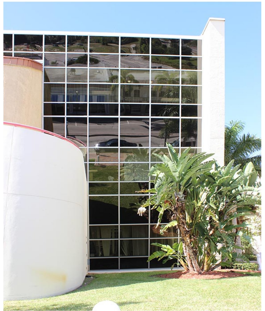
City Hall Side View