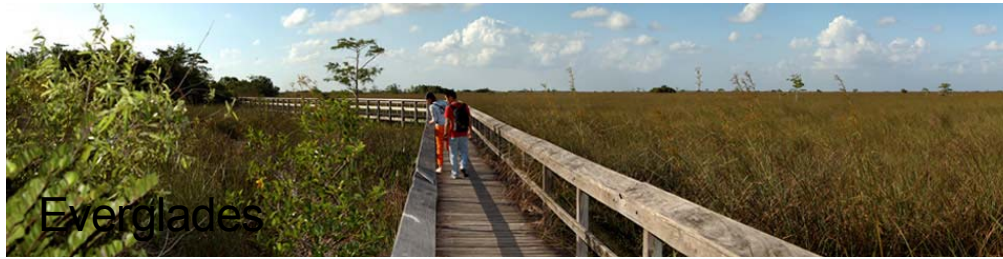
National Park | Florida