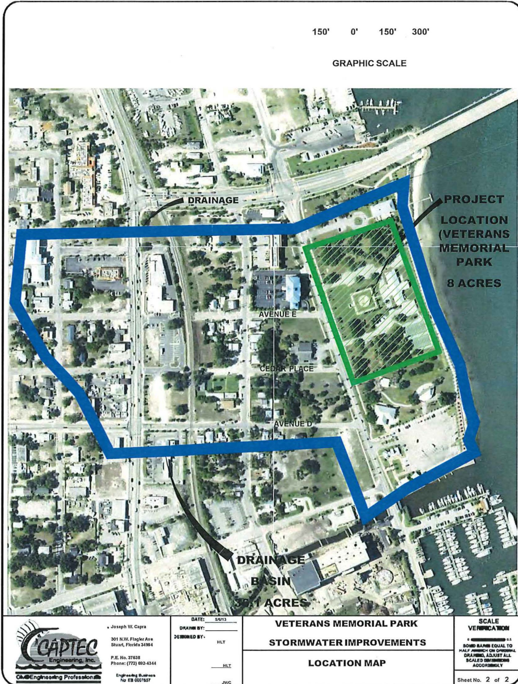
Exhibit 1, Drainage Basin/Treatment Area Map (Includes drainage sub-basins)